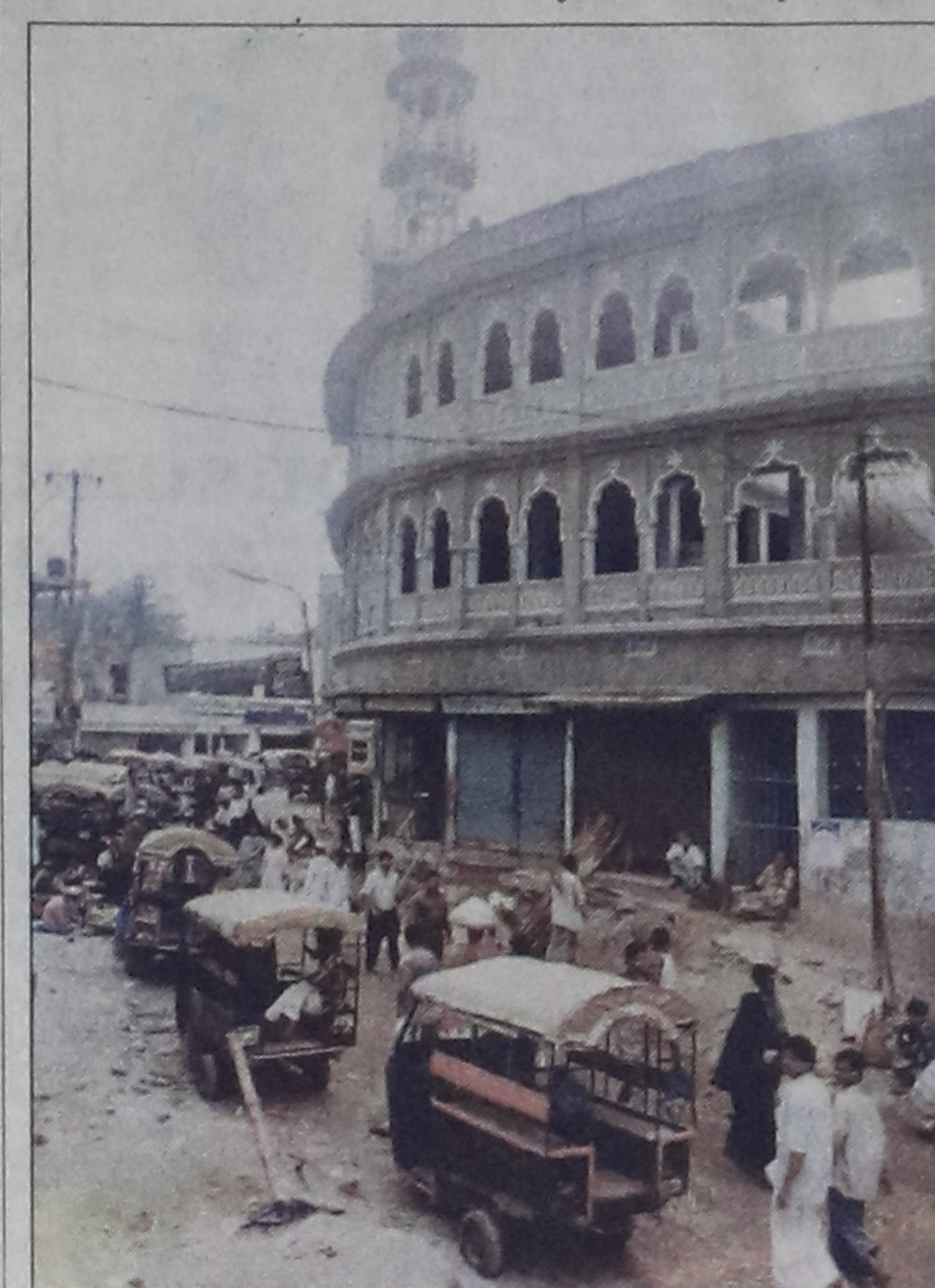
The 400-year-old mosque at Sutrapur. The mosque is now at risk of collapse because of removal of earth from around its foundation for road construction.

The extended part of a 400-year old mosque in Lohar Pool area at Sutrapur in the city is now at risk of collapse as authorities of the Tk 33 crore Dholakhal Improvement Project (DIP) have removed earth from around its foundation to construct a road.