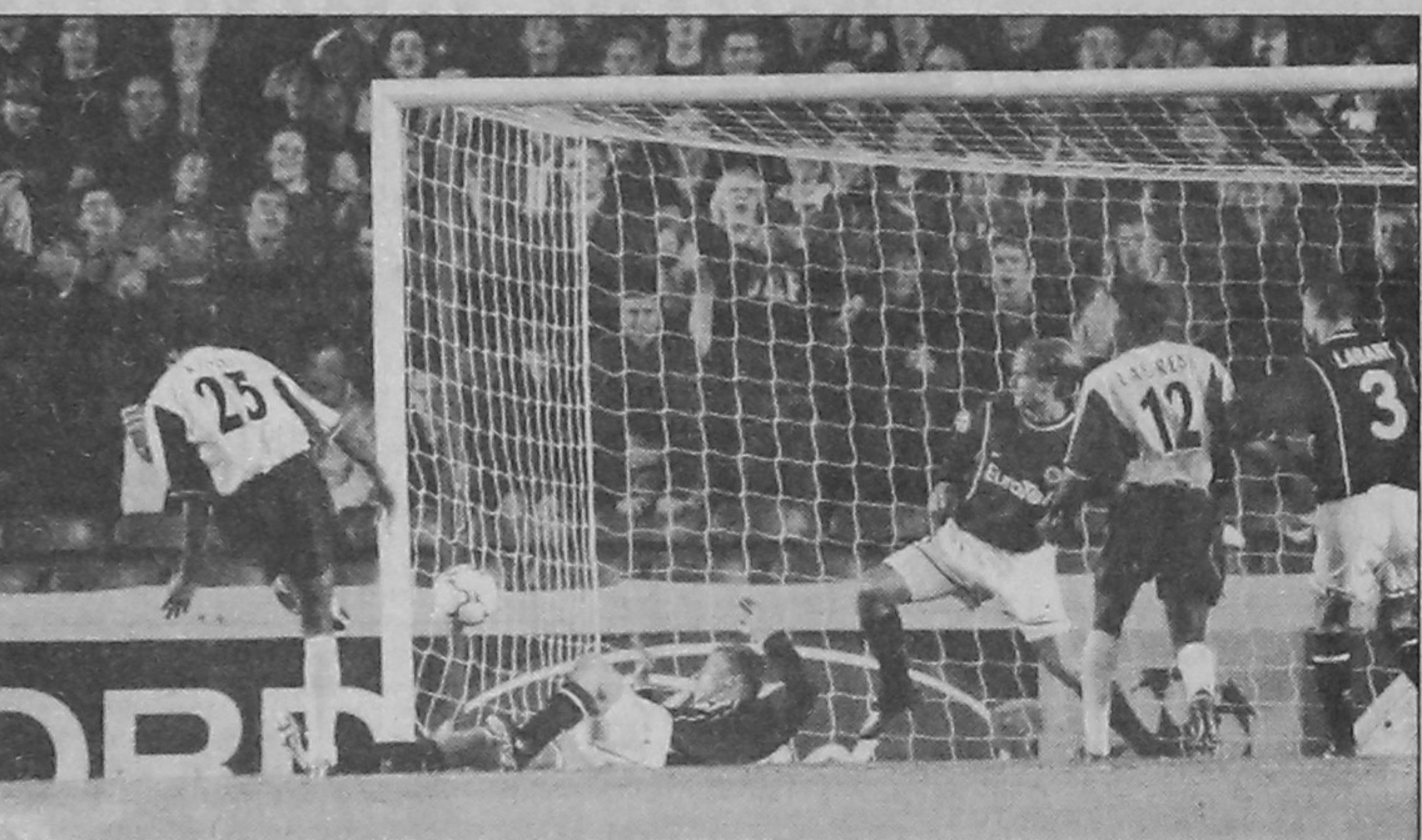
Arsenal's Nigerian star Nwankwo Kanu (L) places the ball into the Sparta Prague goal during their UEFA Champions' League encounter at Highbury on October 25.

"On the one hand we were unable to open up the Real defence and on the other we lacked concentration on our own defence. I hoped for more from my team, but it just wasn't our night."