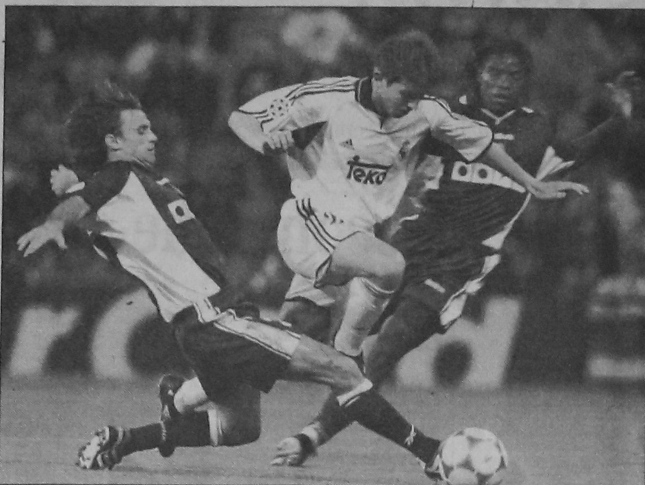
Real Madrid's Albert Celades (C) trying to evade a sliding tackle from Sporting Lisbon's Sa Pinto (L) during their UEFA Champions' League fixture at Madrid on October 25.

Mihajlovic went on to claim that former colleagues when he was at Sampdoria Ruud Gullit, Clarence Seedorf and Christian Karembeu - all black players - would confirm his good character.