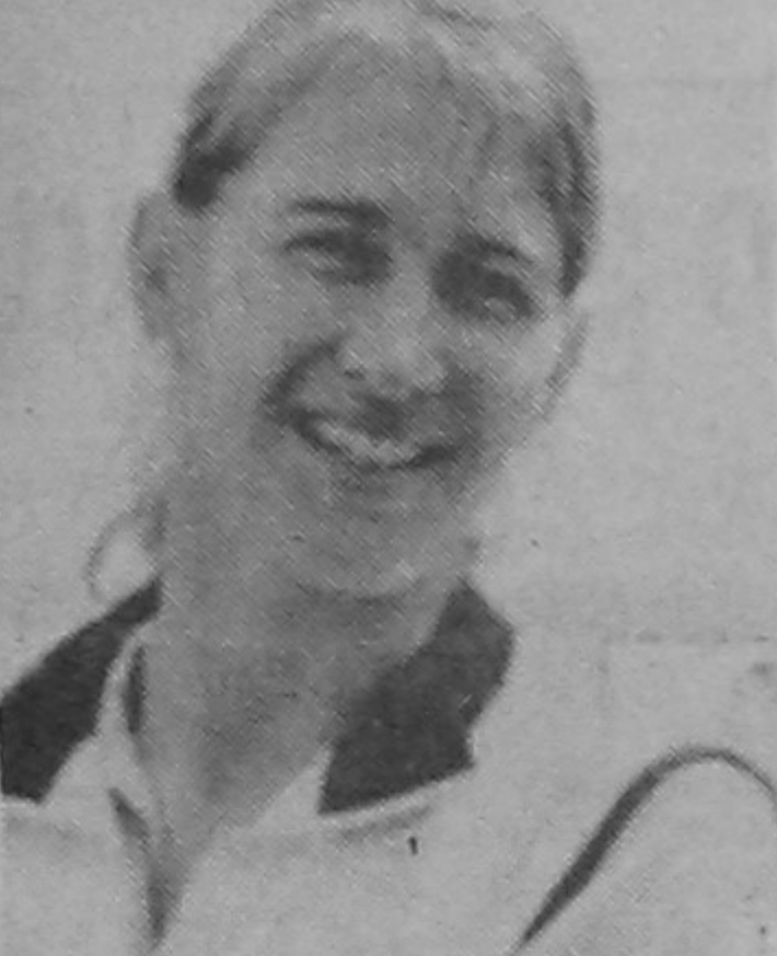
Steffi Graf (German tennis great) "I always say to myself, 'you must do something, you can't turn your back so easily now'."