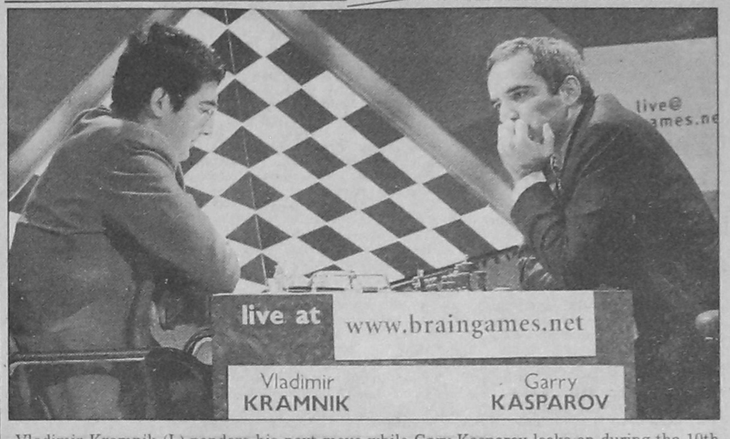
Vladimir Kramnik (L) ponders his next move while Gary Kasparov looks on during the 10th game of the Brain Games World Chess Championship in London on October 24.