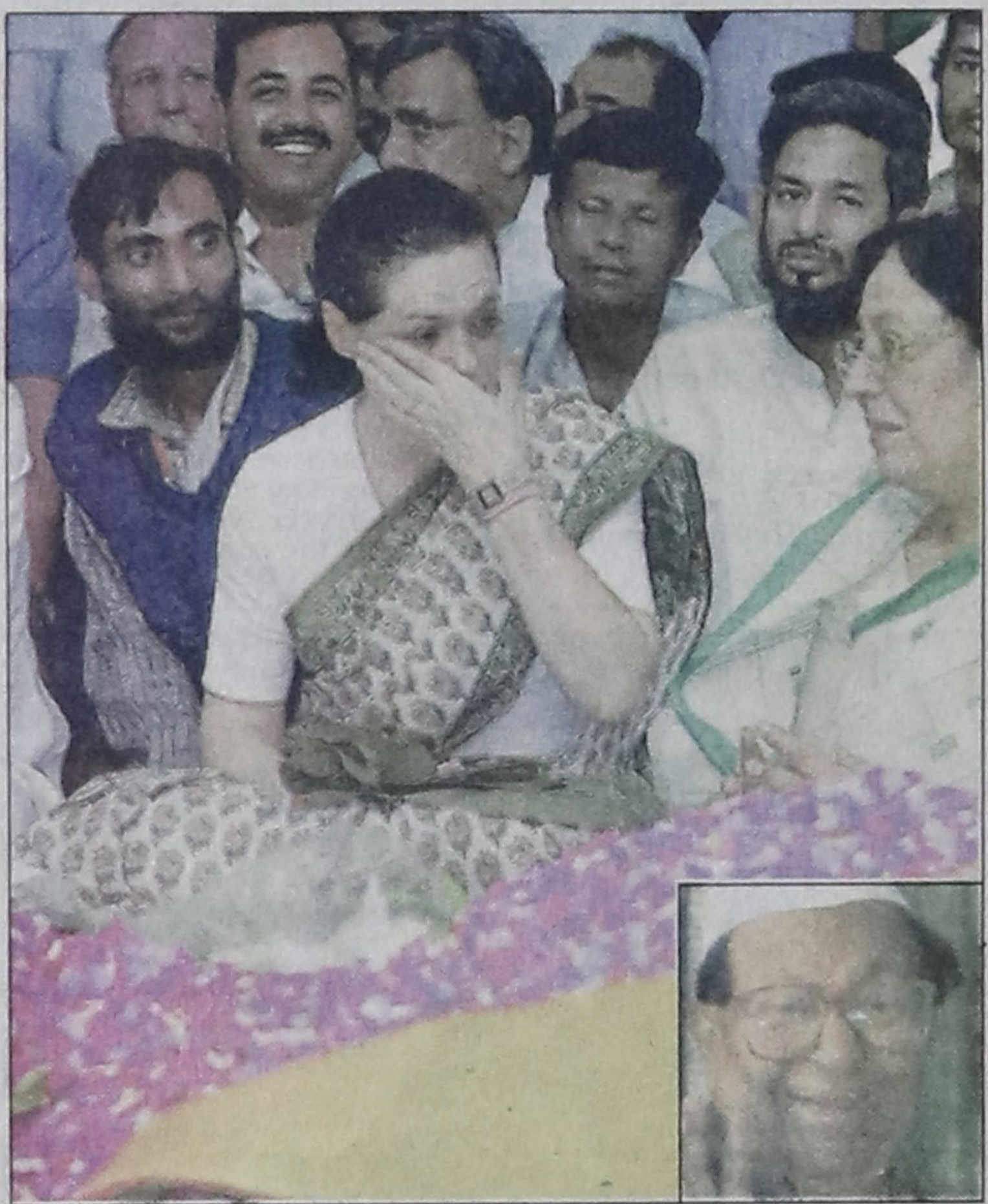
Death, the great leveller... Congress President Sonia Gandhi (C) wipes her eyes during a wake at the party headquarters for former party president Sitaram Kesri (inset) in New Delhi yesterday. Kesri, 81, died on Tuesday of a pulmonary embolism. Story on page 9.