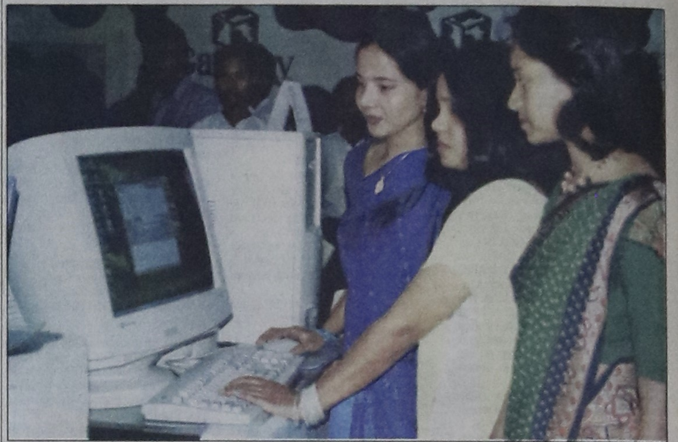
A look into the future... three young women have their eyes glued to the computer screen on the inaugural day of the week-long City IT 2000 at the BCS Computer City, IDB Bhaban at Agargaon in the city.