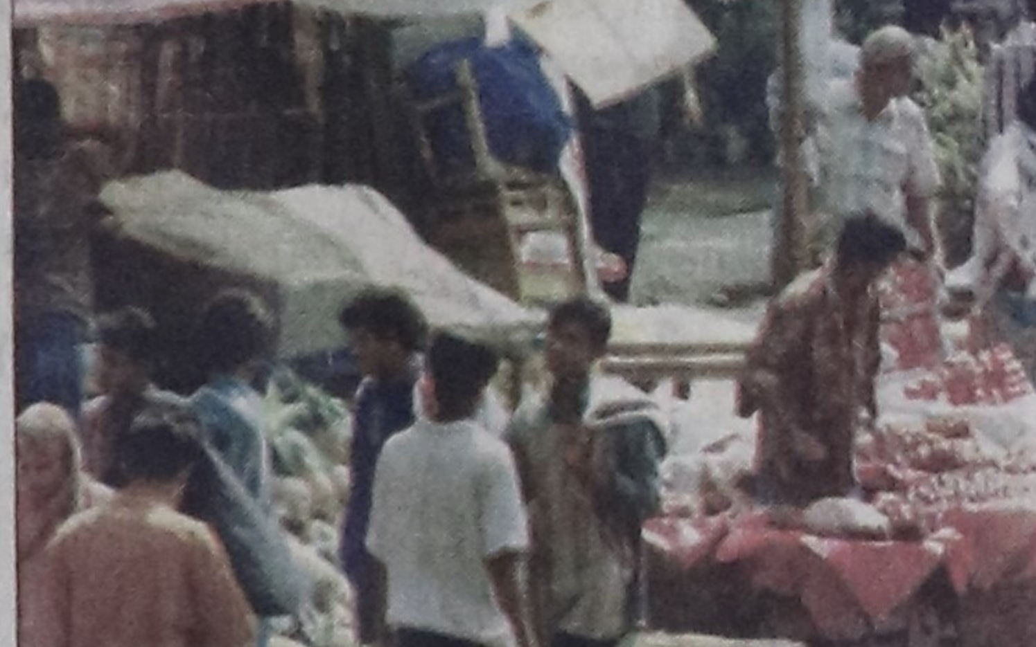
Mole under the nose... the fruit market on the pavement near the recently inaugurated Gulistan Police Box makes a mockery of the police drive to reclaim the footpaths in the city from the grips of hawkers.