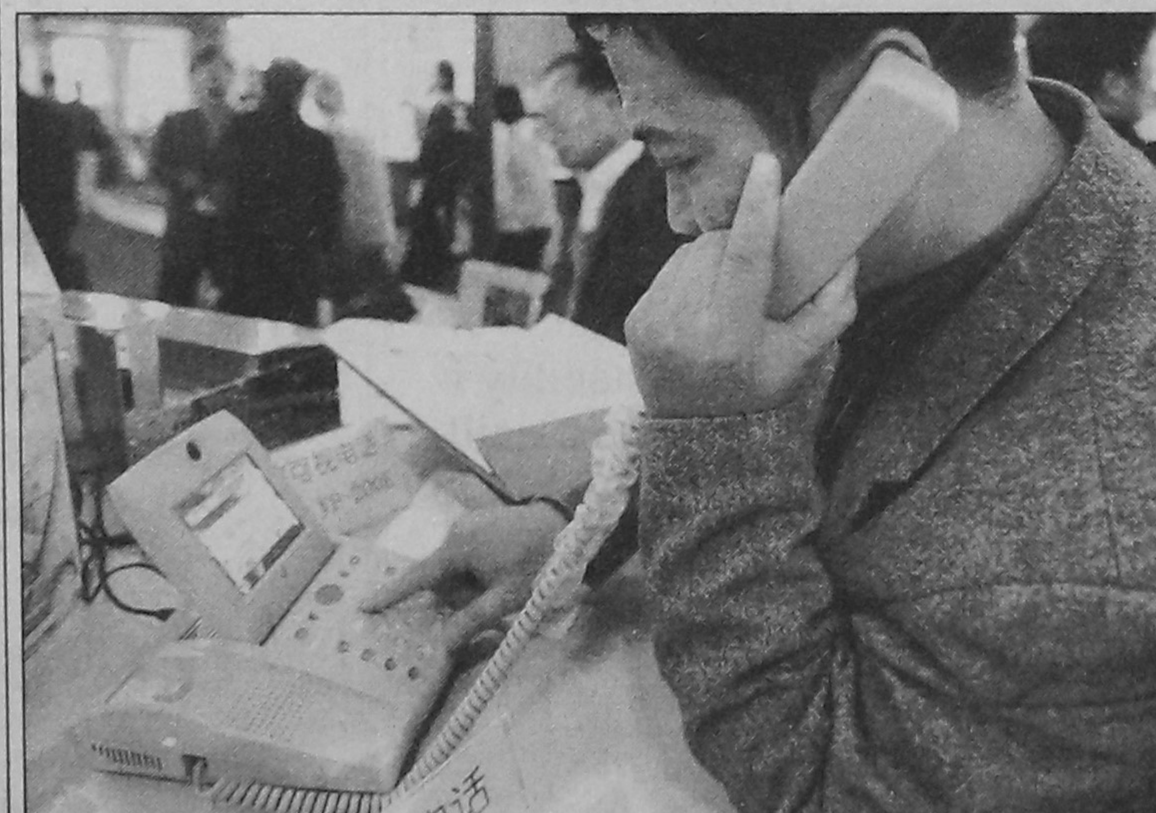
A visitor tries to use the latest videophone on display at a telecommunication show in Beijing yesterday. China's telecommunication industry is currently undergoing major restructuring to open up to market competition, in anticipation of the country's membership to the World Trade Organization.

The overall business performance of the bank was discussed in the conference. Addressing the conference Mohammad Ali, Chairman of the bank, said everyone will have to give special attention for easy bank loan for development of socio-economic activities of the flood affected areas of south-eastern part of the country as soon as flood water recedes.