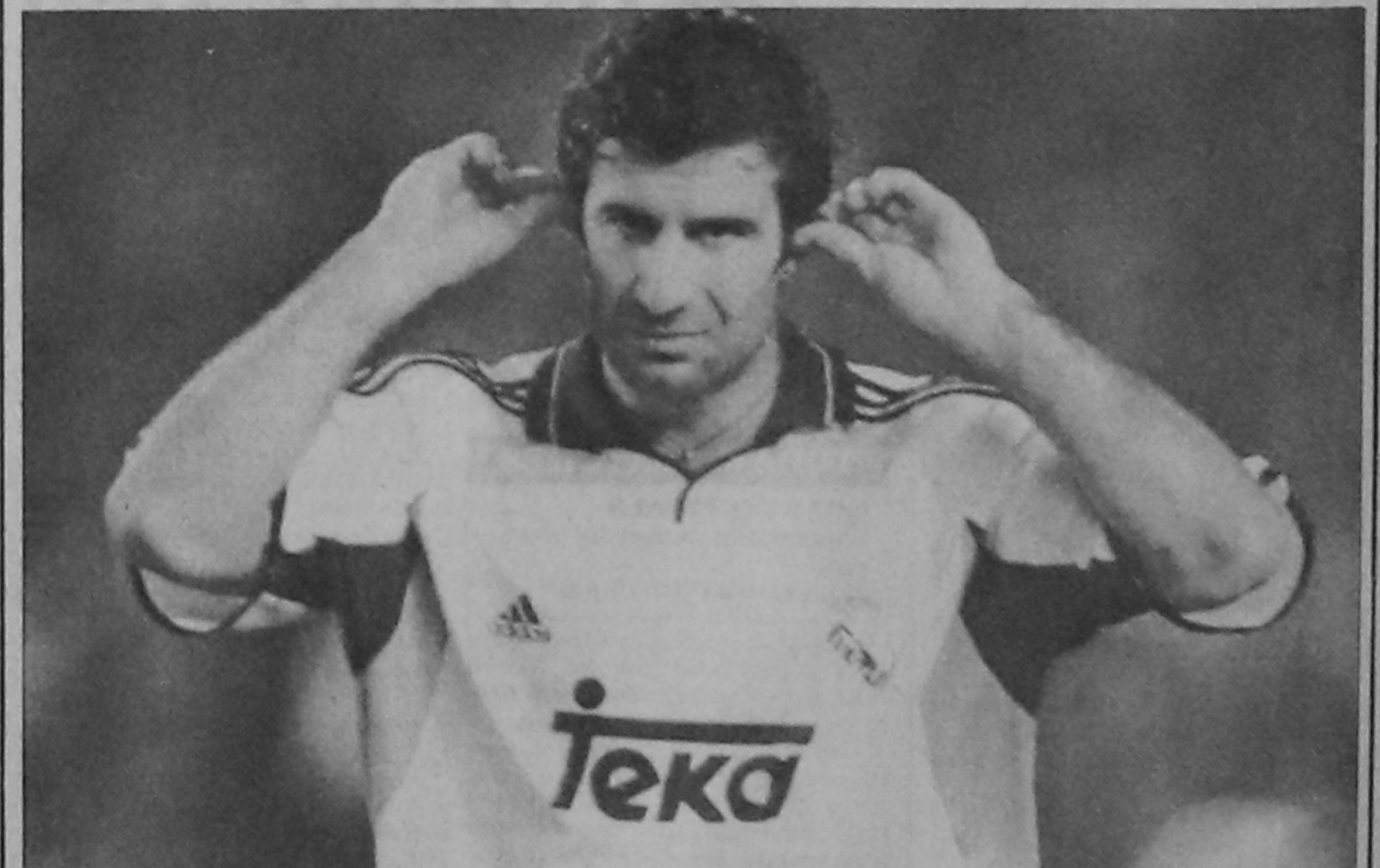
CAN'T TAKE IT ANYMORE! Real Madrid maestro Luis Figo closes his ears to stop hearing the venomous boos from Barca fans during their Primera Liga clash at the Nou Camp on October 21.

Figo moved from Barcelona to European champions Real in July for a world record $6.1 million dollars.