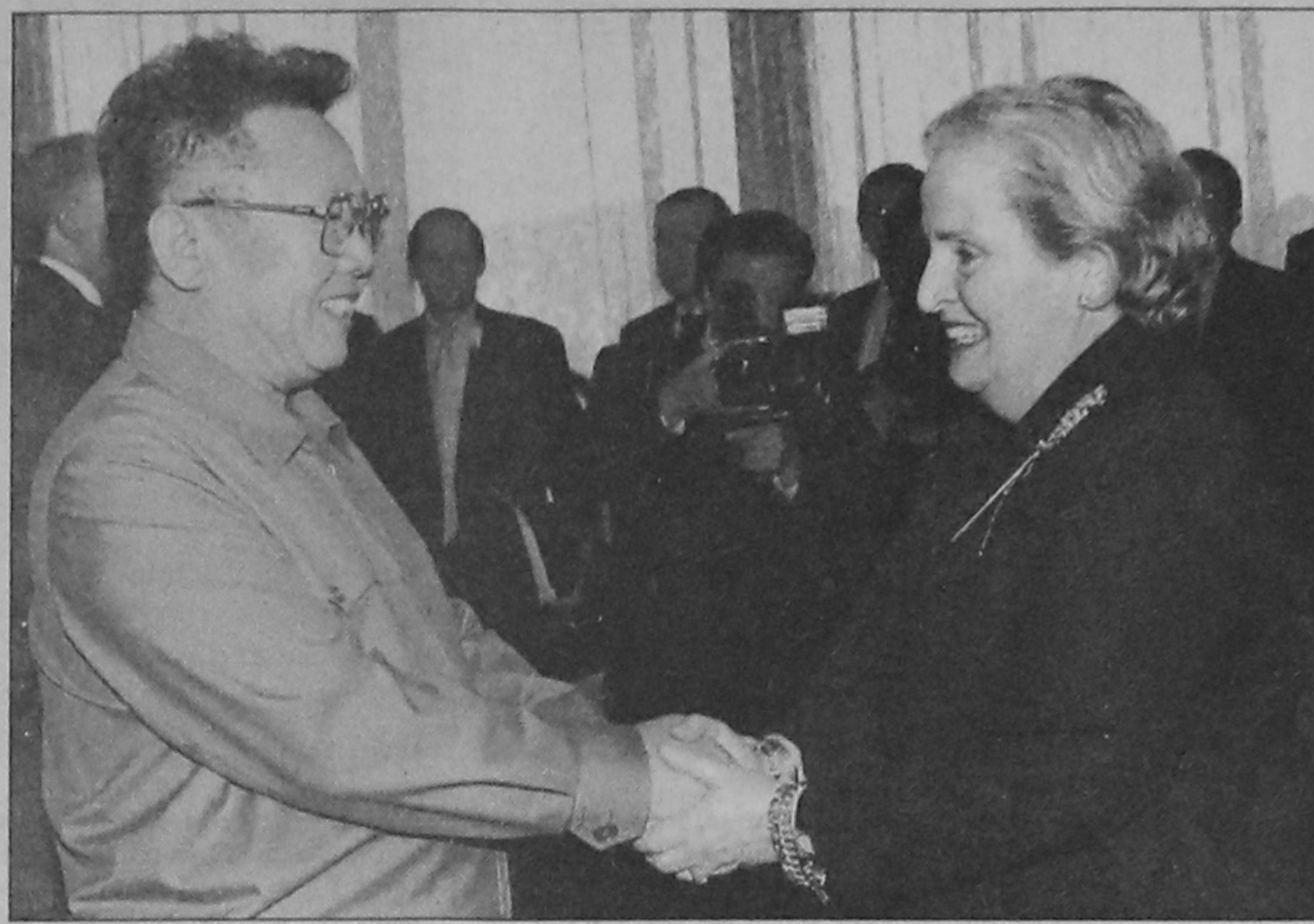
North Korean Leader Kim Jong-Il (L) shakes hands with US Secretary of State Madeleine Albright at the Pae Kha Hawon Guest House in Pyongyang Monday. Albright, the highest level US official to visit North Korea in 50 years, met with the North Korean leader in an effort to ease tensions between the two nations.

significant breakthroughs during Albright's two-day visit, they say they believe "serious progress" can be made in addressing Washington's concerns, including on the missile issue.