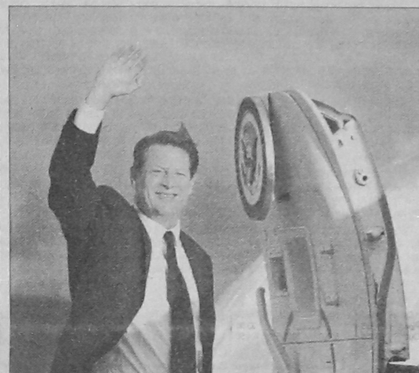
Democratic presidential candidate and US Vice President Al Gore, boards an Air Force II plane on Sunday in Albuquerque, New Mexico for a flight to Portland, Oregon.

GUWAHATI, India, Oct 23: Separatist guerrillas killed 15 people, including a three-year-old boy, in India's northeastern state of Assam on Sunday night, police said, reports Reuters.