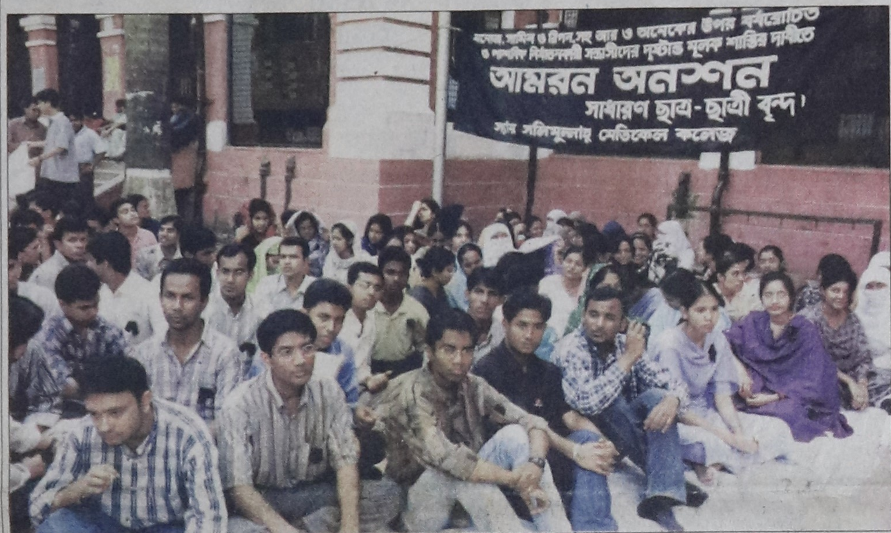
Hungry for peace... Students of Sir Salimullah Medical College began a hunger strike in front of the principal's office yesterday morning to protest the reign of terror unleashed allegedly by some BCL activists. Later, on the principal's assurance that she would ensure a peaceful solution to the problem, the protesters withdrew their programme.