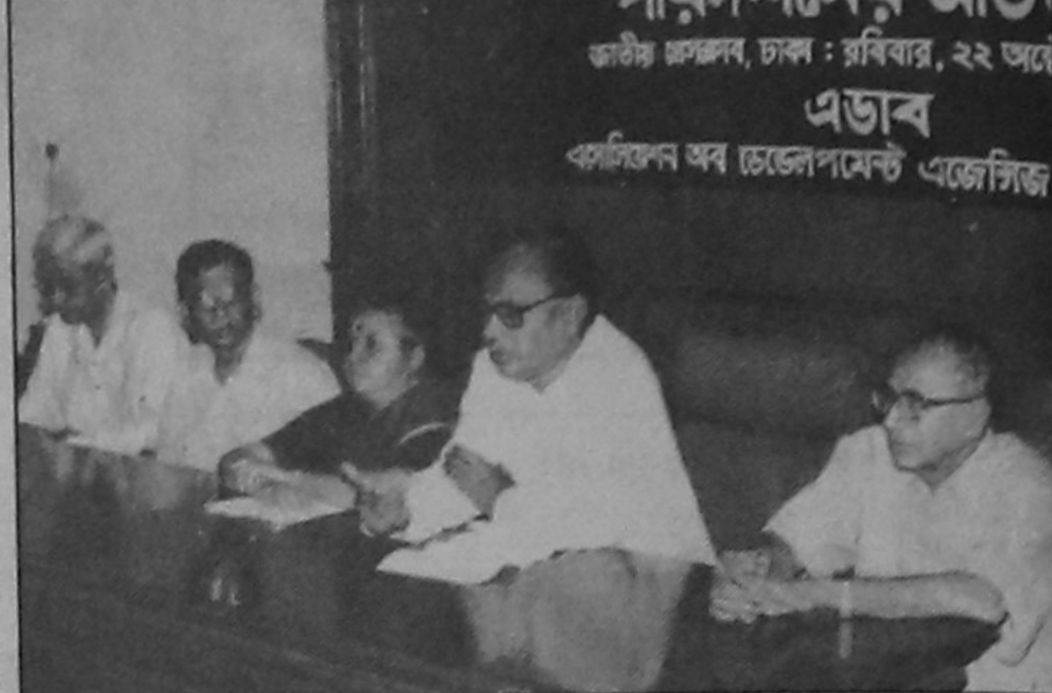
Association of Development Agencies in Bangladesh (ADAB) held a press conference at the National Press Club yesterday on the outcome of a meeting of ADAB representatives with the local administration, bar council and press club members at Laxmipur Circuit House on Saturday.