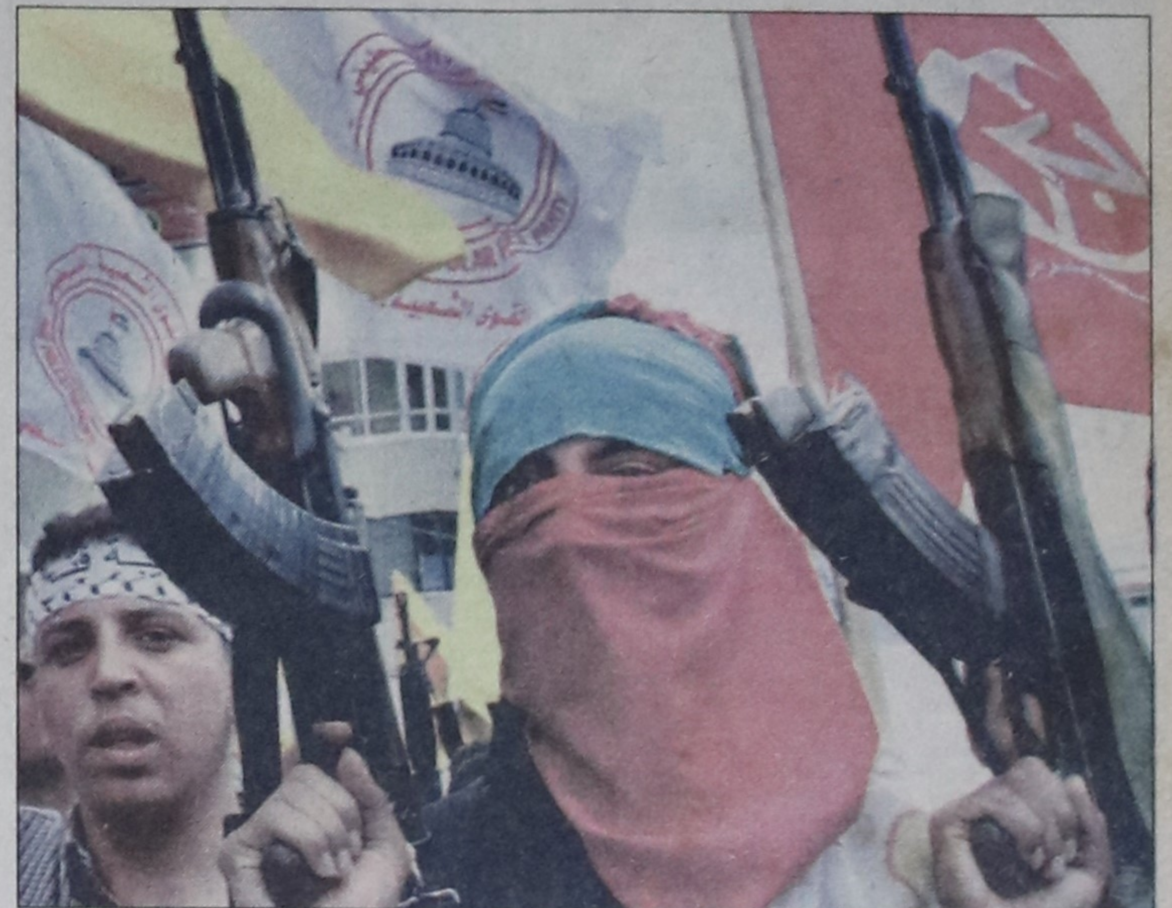
Members of Yasser Arafat's mainstream Fatah movement demonstrate in Gaza City against the Arab summit yesterday. Israeli and Palestinian territories were gripped by tension again as a Palestinian was killed in renewed clashes with Israeli troops as the emergency Arab summit came to an end in Cairo yesterday.

According to police sources, a total of 1379 firearms were seized and 132 people arrested during the last four months across the country. More than 700 cases were filed with different police stations.