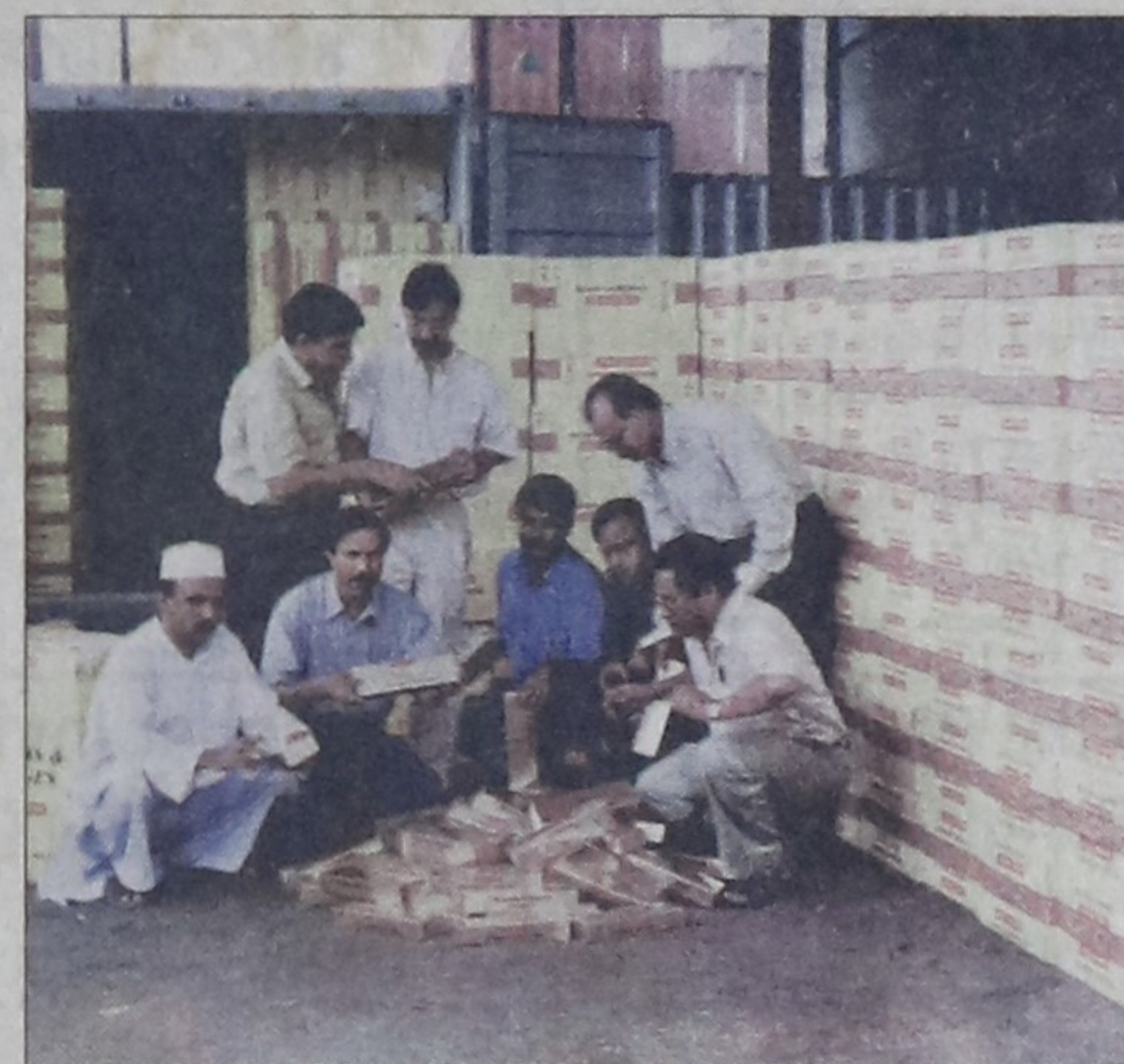
A huge consignment of foreign cigarettes was confiscated from the Customs Container Terminal in the city's Kamalapur area yesterday.

The DG of BSF said that all the issues were taken up with his government but unfortunately most of these are still unresolved. At least 22 people have been killed and 28 injured in 38 incidents of firing by BSF and Indian nationals from across the border so far.