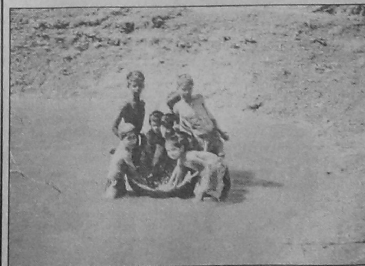
Innocent faces: Right to play is a basic right of all children. But the recreational facilities are limited in a district town like Sirajganj. So where do the children go? Photo shows some poor children enjoying the game of fishing by making the most of rain waters accumulated in a ditch situated at the western side of Sirajganj Circuit House. They also earn some money by selling fish.

The projects include road carpeting, construction of drain, bridge, culvert and roads. Officials sources said 80 per cent of the works has already been completed while the rest is likely to be completed by the next month.