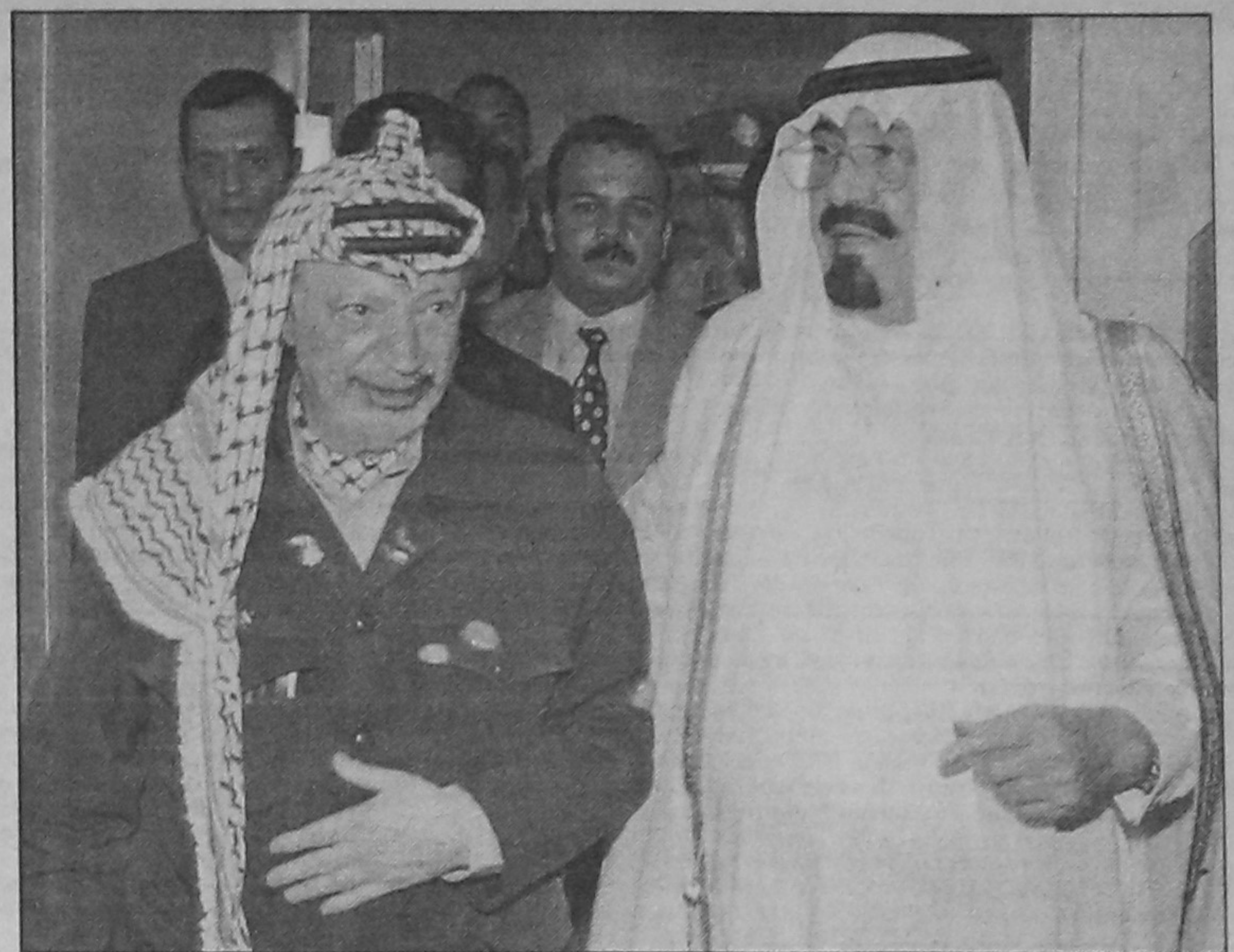
Palestinian Authority President Yasser Arafat (L) walks with Saudi Crown Prince Abdullah bin Abdul Aziz in Cairo late Friday on the eve of an Arab summit to discuss the violence that has rocked the Palestinian territories since September 28 leaving more than 120 people dead. This is the first Arab summit since 1996.

Israeli foreign ministry spokesman Noam Katz called the deadline "flexible."