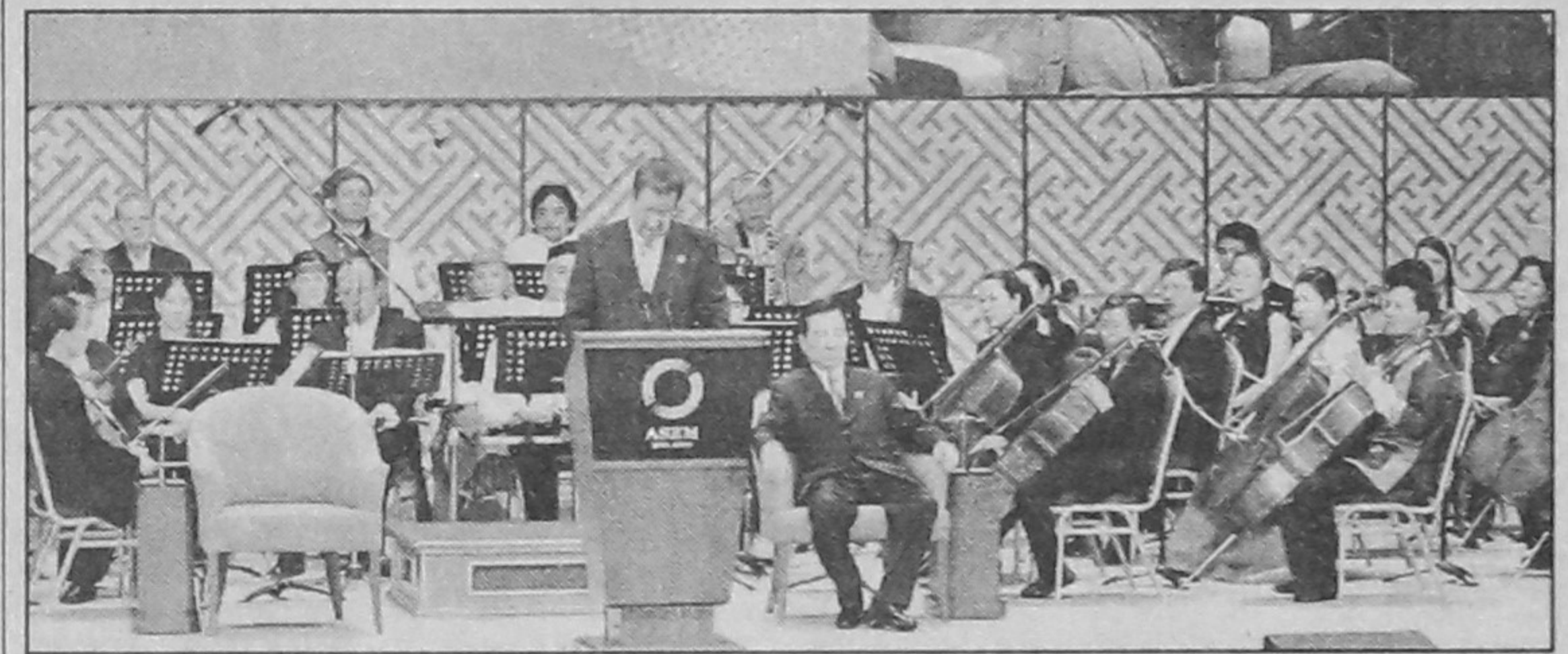
Danish Prime Minister Poul Nyrup Rasmussen (C) speaks as South Korean President Kim Dae-Jung (seated right of podium) listens during the closing ceremony of the third Asia-Europe Meeting (ASEM) in Seoul yesterday. Leaders from Europe and Asia held final talks on the final day of their summit, with their agenda focussed again on trying to catch up with overnight developments over North Korea. Denmark will host the next ASEM summit in 2002.

But with 16 separate measures passed and seven more "noted", diplomats said future summits would take a more focused approach to meet concerns that ASEM's work was being too thinly spread.