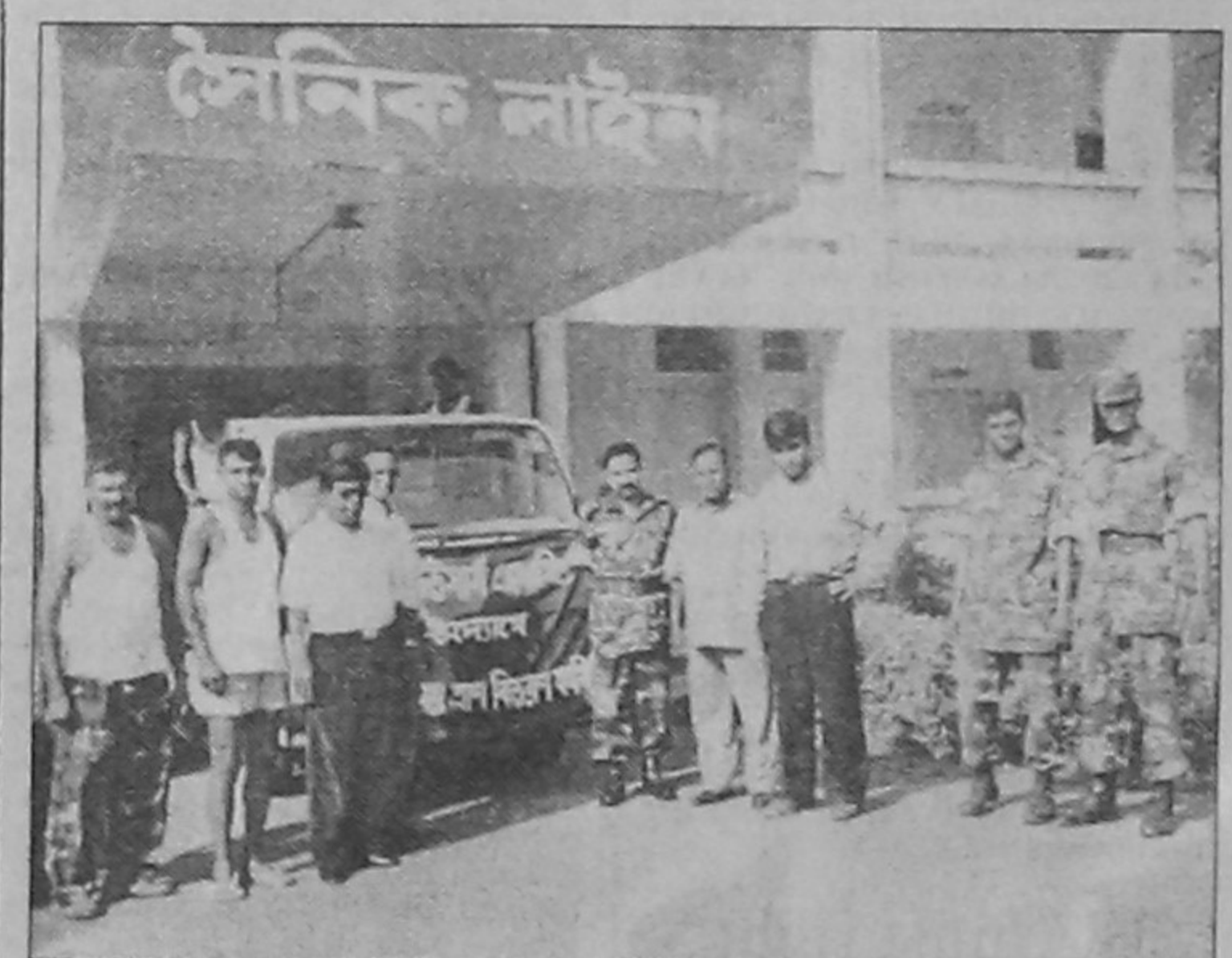
Bangladesh Egg Producers Association has distributed relief materials among flood affected people of Jessore and Satkhira districts on Wednesday.