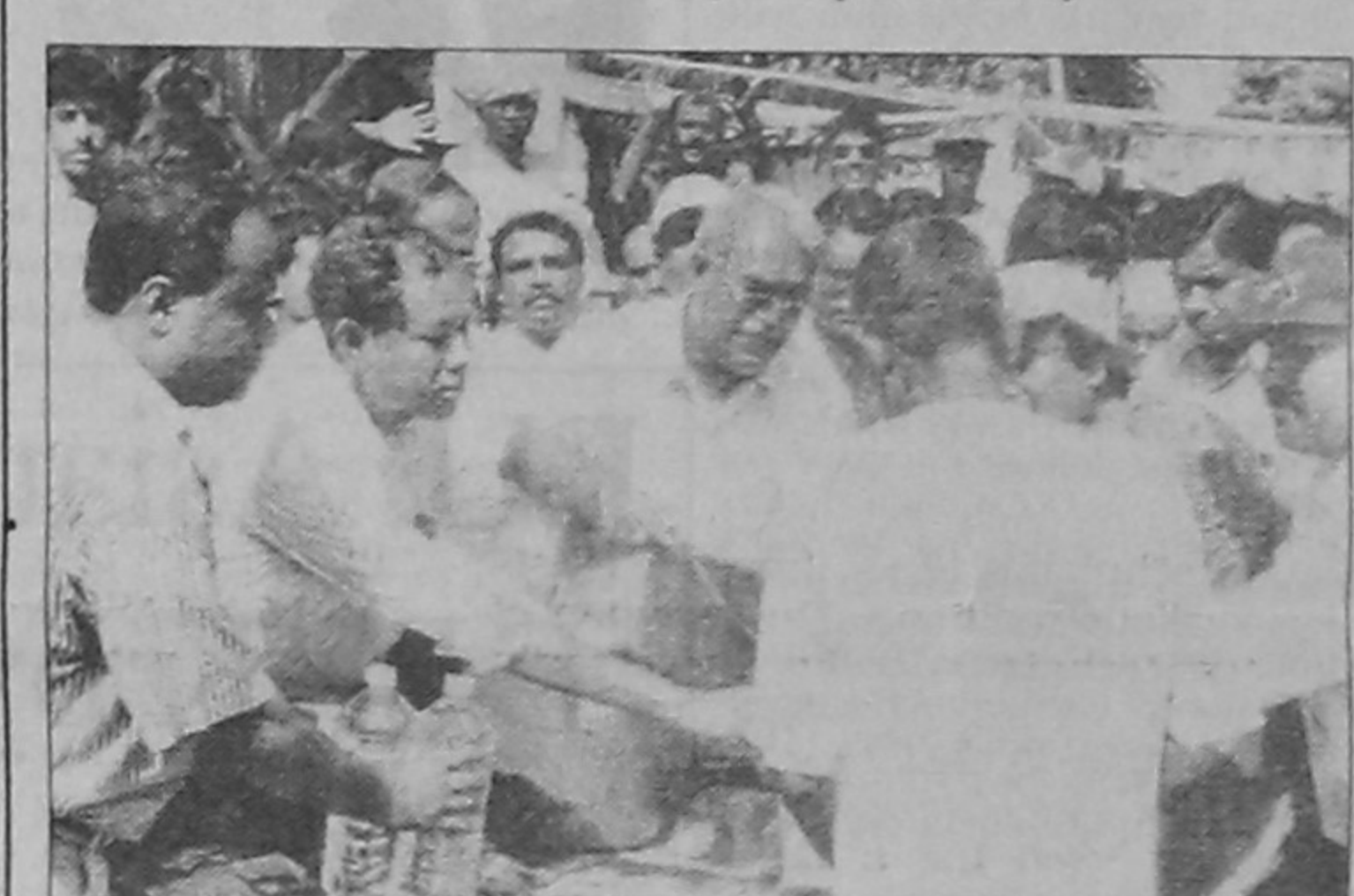
World Vision Bangladesh started its US$ 200,000 second phase relief distribution programme for the flood victims. Picture shows State Minister for Disaster Management and Relief Talukder Abdul Khaleque distributing relief materials among the victims recently.