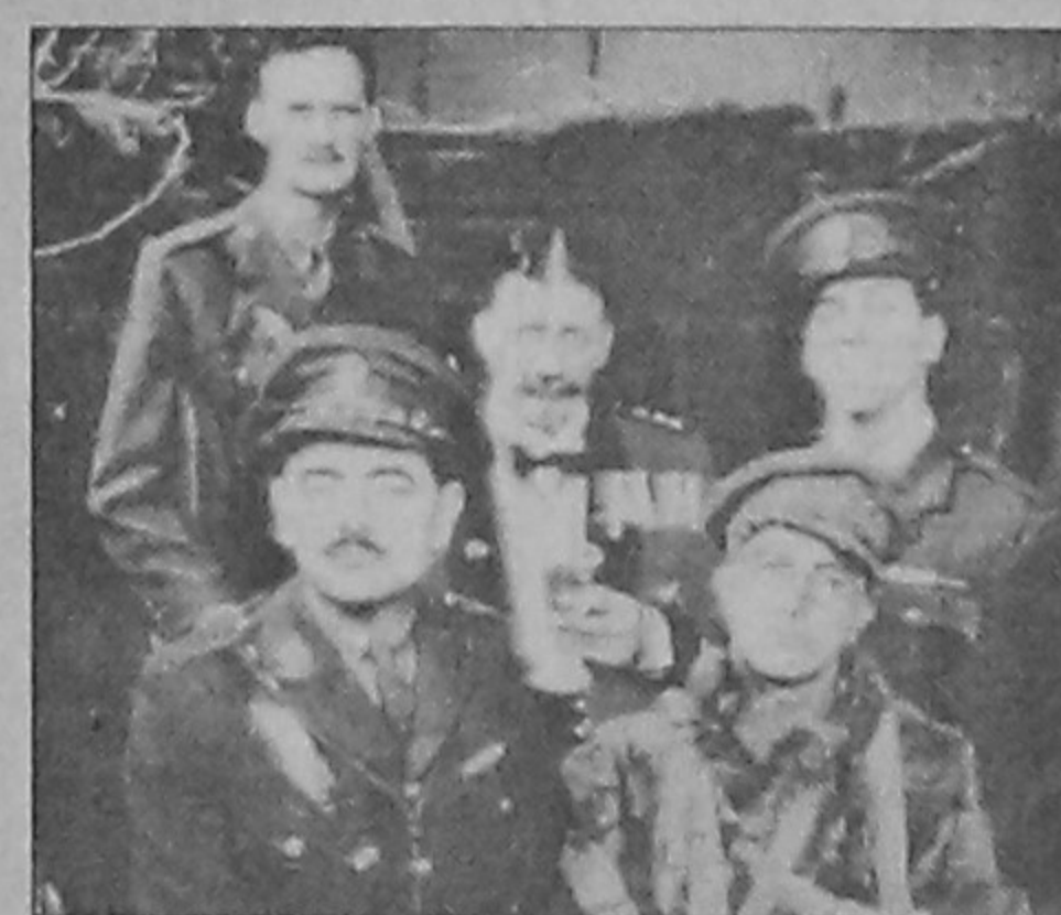
Blackadder Goes Forth on Star World