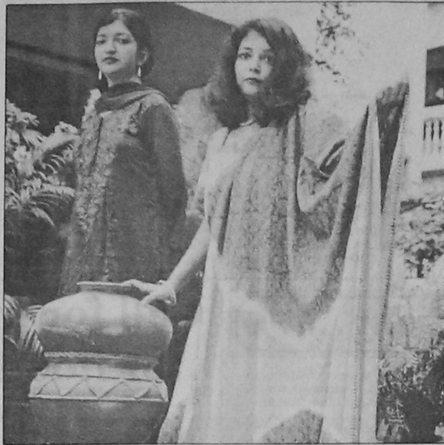
Two block printed dresses in dark purple and beige and brown. The tie n dye work on the brown dress makes it more attractive.

This fashion house, NS 2000 is sponsored by Serve the People. STP is a social service organisation which tries to scout out talents from the underprivileged women of Bangladesh. Especially those who are in remote areas and find few opportunities to break their shackles and the vicious circle of poverty. STP