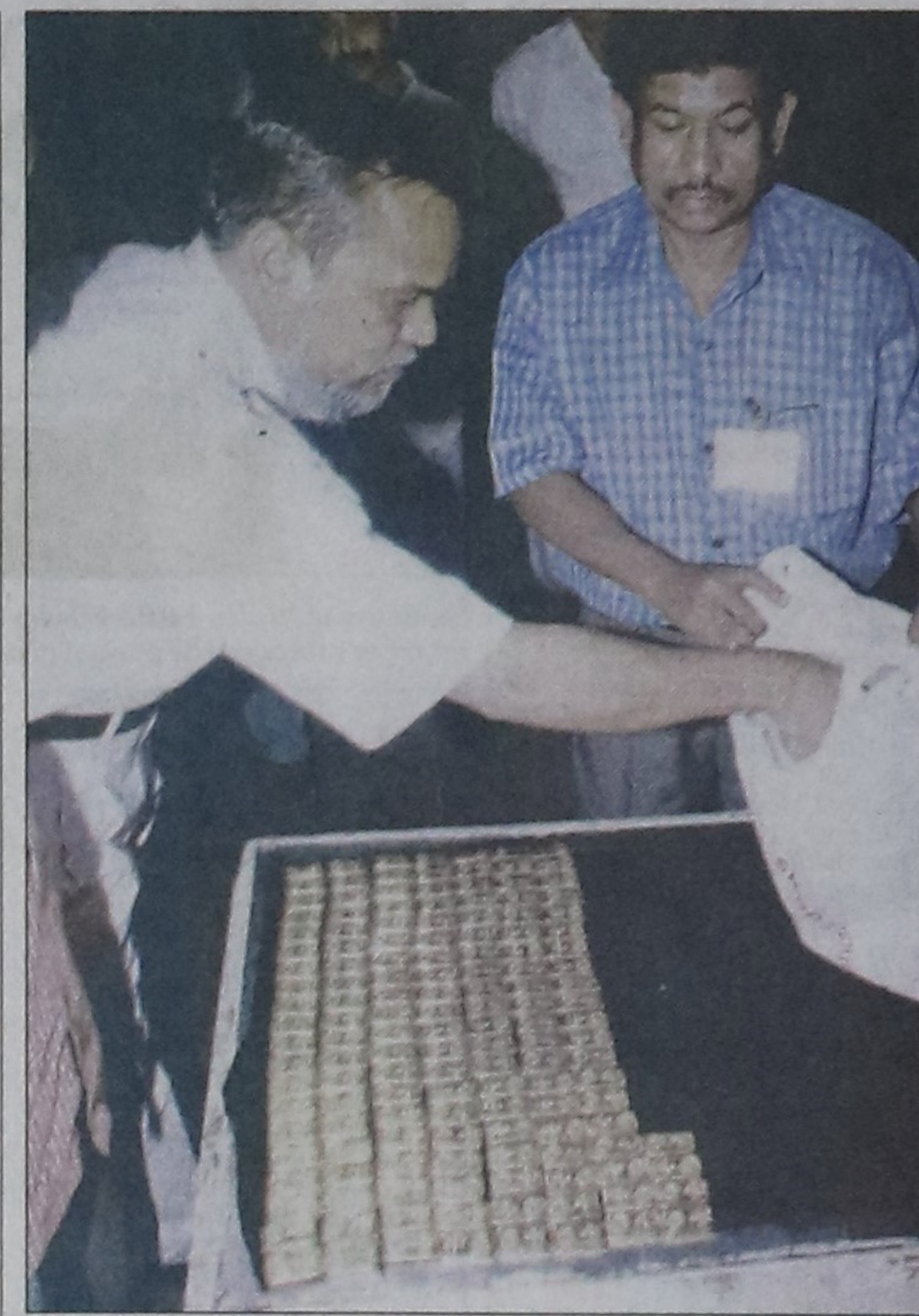
Gold haul... Customs officials at the Zia International Airport intercepted smuggled gold worth more than one crore taka yesterday.

Shamsu is wanted in several criminal and smuggling cases.