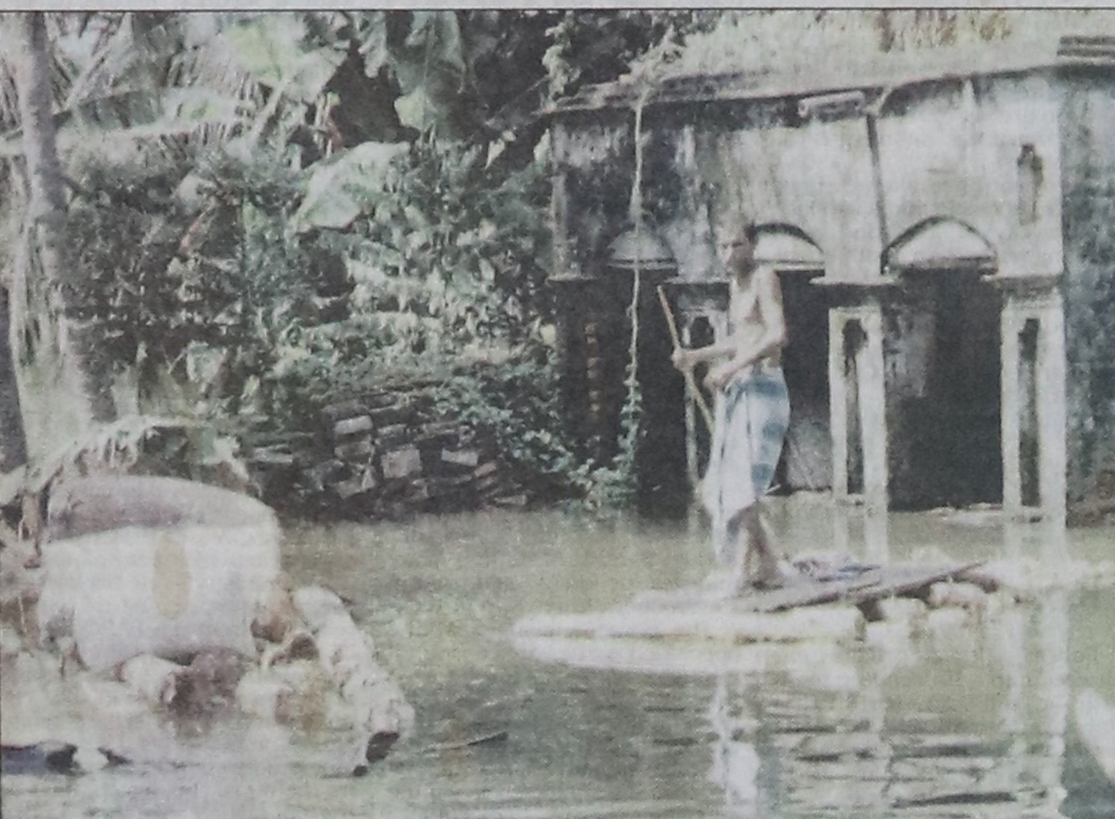
Sadly familiar... An aged man rafts along waist-high water in the flood-hit Chhoigharia, a small village of Bokari Union in Satkhira. Although overall situation has improved, floodwater is yet to recede in many places.