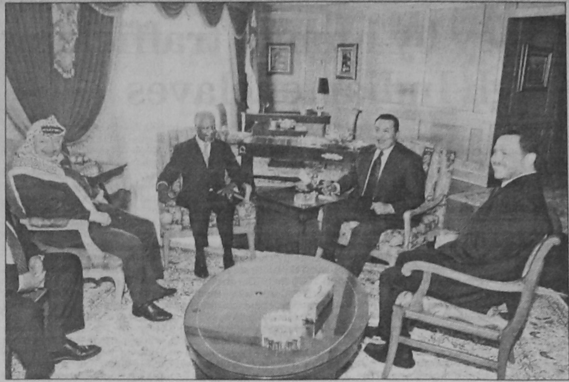
From L to R, Palestinian Authority President Yasser Arafat, United Nations Secretary General Kofi Annan, Egyptian President Hosni Mubarak and King Abdullah II of Jordan meet in Sharm el-Sheikh yesterday on the second day of the Middle East summit aimed at bringing an end to the unrest that has threatened the Israeli-Palestinian peace process.