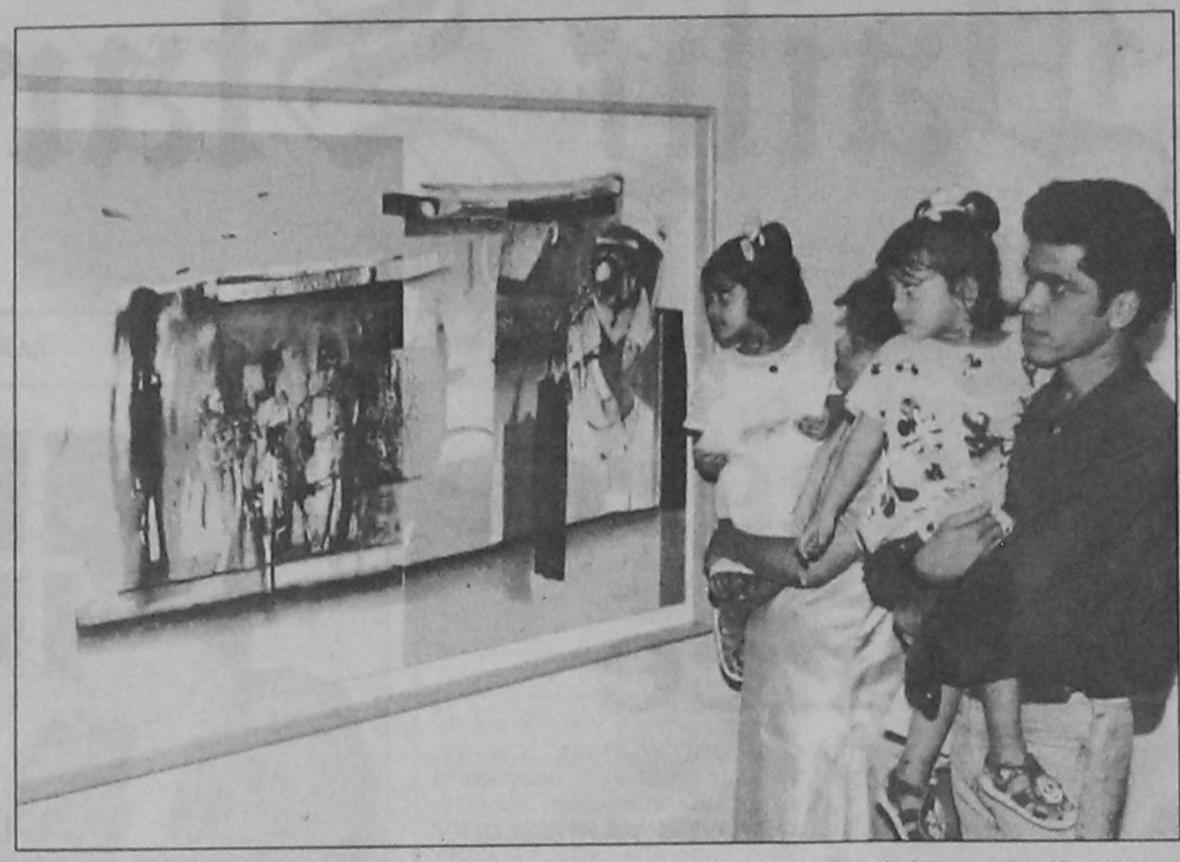
Visitors at the solo exhibition of Bipol Shaha's paintings at the Zainul Gallery of the Fine Arts Institute. The 10-day long show of the artist's works began yesterday.

Different student organisations also took part in the campaign and collected about Tk 10,000 on the first day.