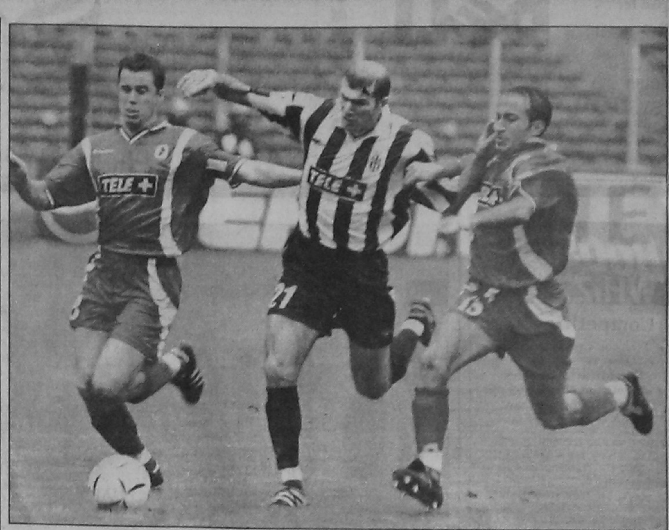
Juventus' French international playmaker Zinedine Zidane (C) trying to make his way through two Bari players during their Serie A clash in Turin on October 15.

Del Bosque may also choose to make a tactical switch, replacing the lacklustre Brazilian midfielder Flavio Conceicao and with Ivan Helguera, just as he did in the second half against