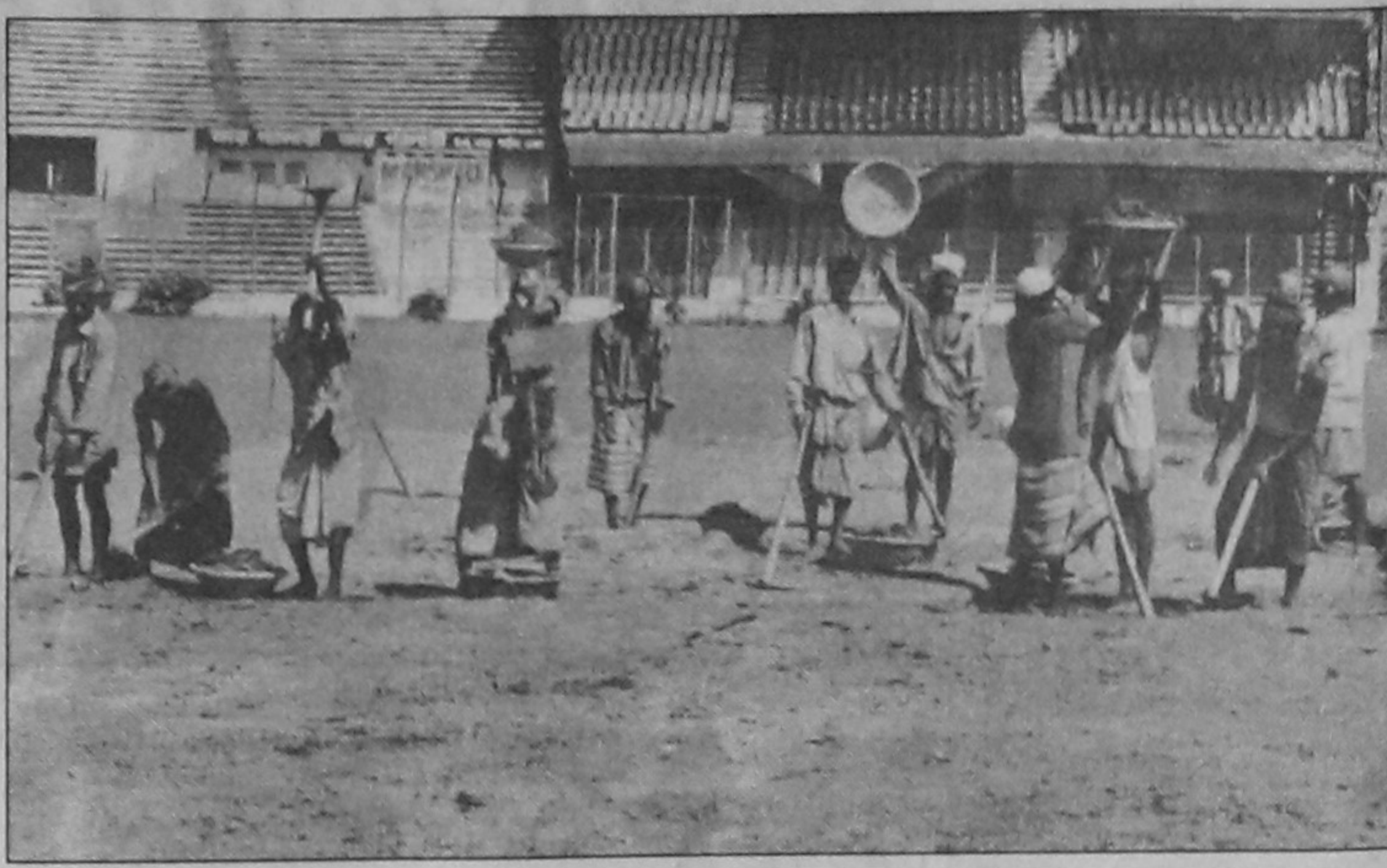
Workers removing part of the top soil of the Bangabandhu National Stadium yesterday as part of preparation of cricket pitches for Bangladesh's inaugural Test against India.