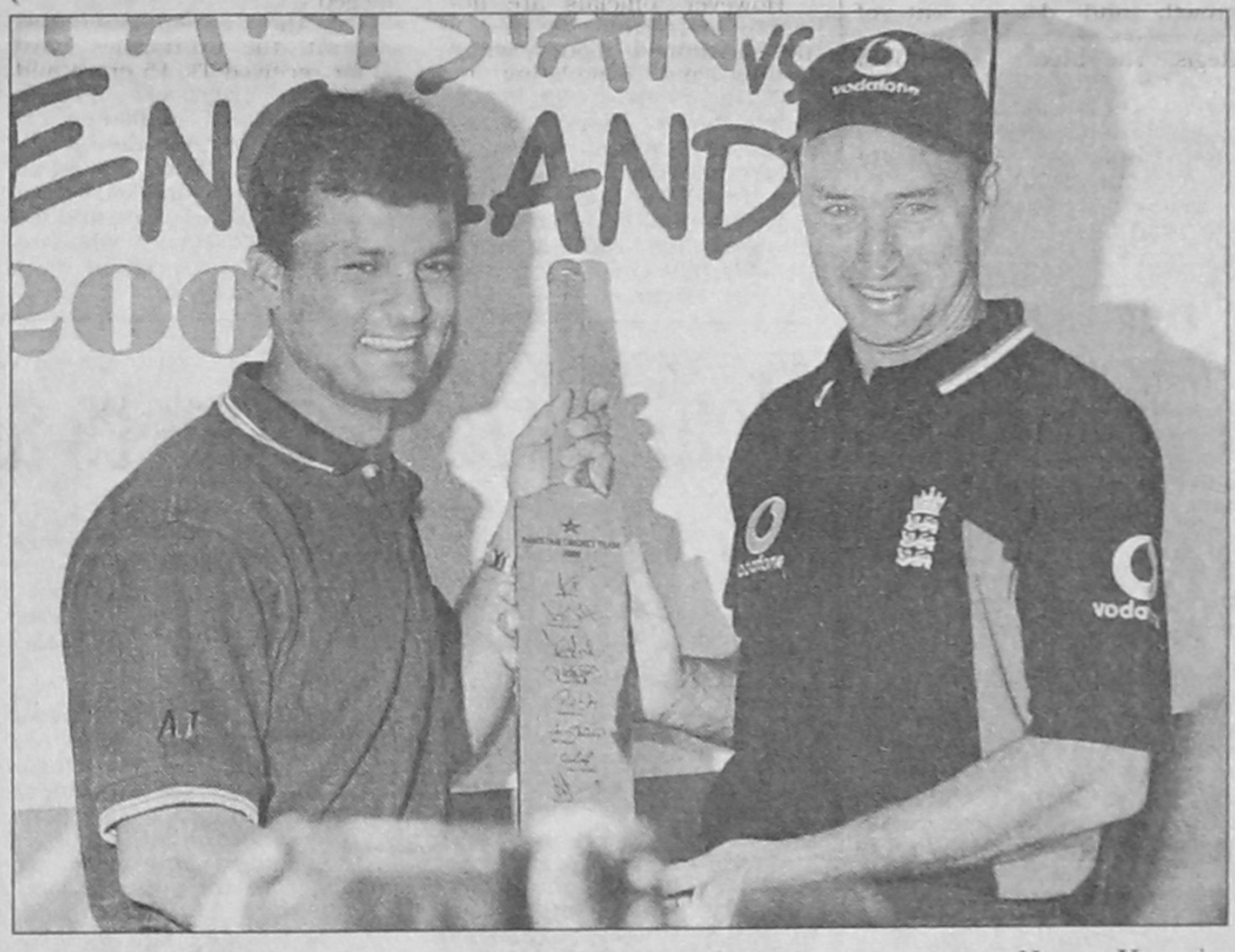
Pakistan cricket captain Moin Khan (L) presenting his England counterpart Nasser Hussain with an autographed bat by his team during a press conference in Karachi yesterday.