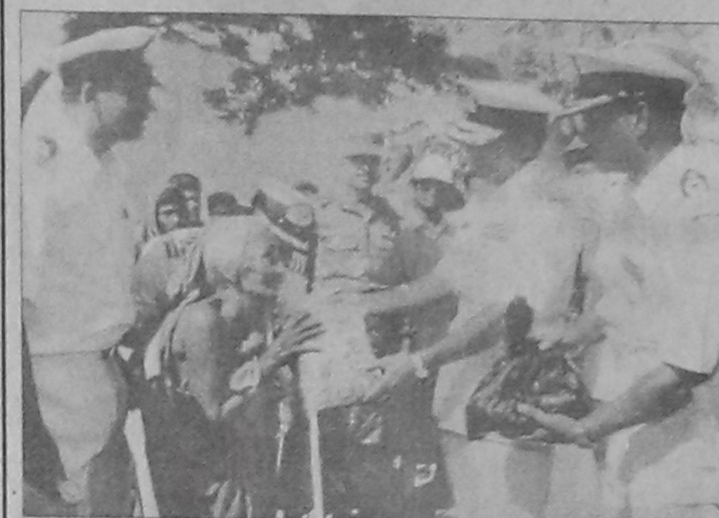
Chief of the Naval Staff Rear Admiral A Taher distributing relief materials among the flood victims in Satkhira last week.

The authorities on Monday morning suspended the movement of Ro Ro ferry running on Aricha-Daulatdia route. A large number of long distance passengers had to undergo suffering in the hot weather as a lot of vehicles remained stranded on both sides of the two ghats on Tuesday. The channel of the river is being gradually filled up with silts due to massive erosion and flow of sands with water from across the border. A BIWTA official said dredging works on Aricha-Nagarbari-Daulatdia route started from Sept 2 in order to maintain navigability on this sensitive route.