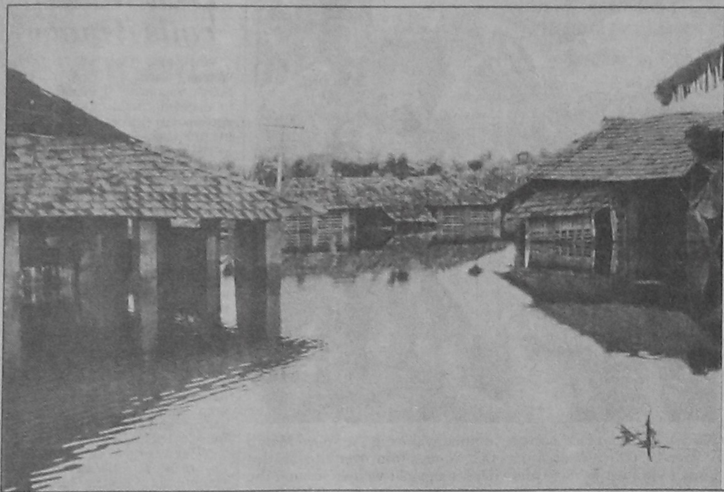
(Left) Madhabkathi in Satkhira Sadar upazila still remains under flood waters, (Right) flood victims in Khalilnagar area under the same upazila waiting for succour for a long time.