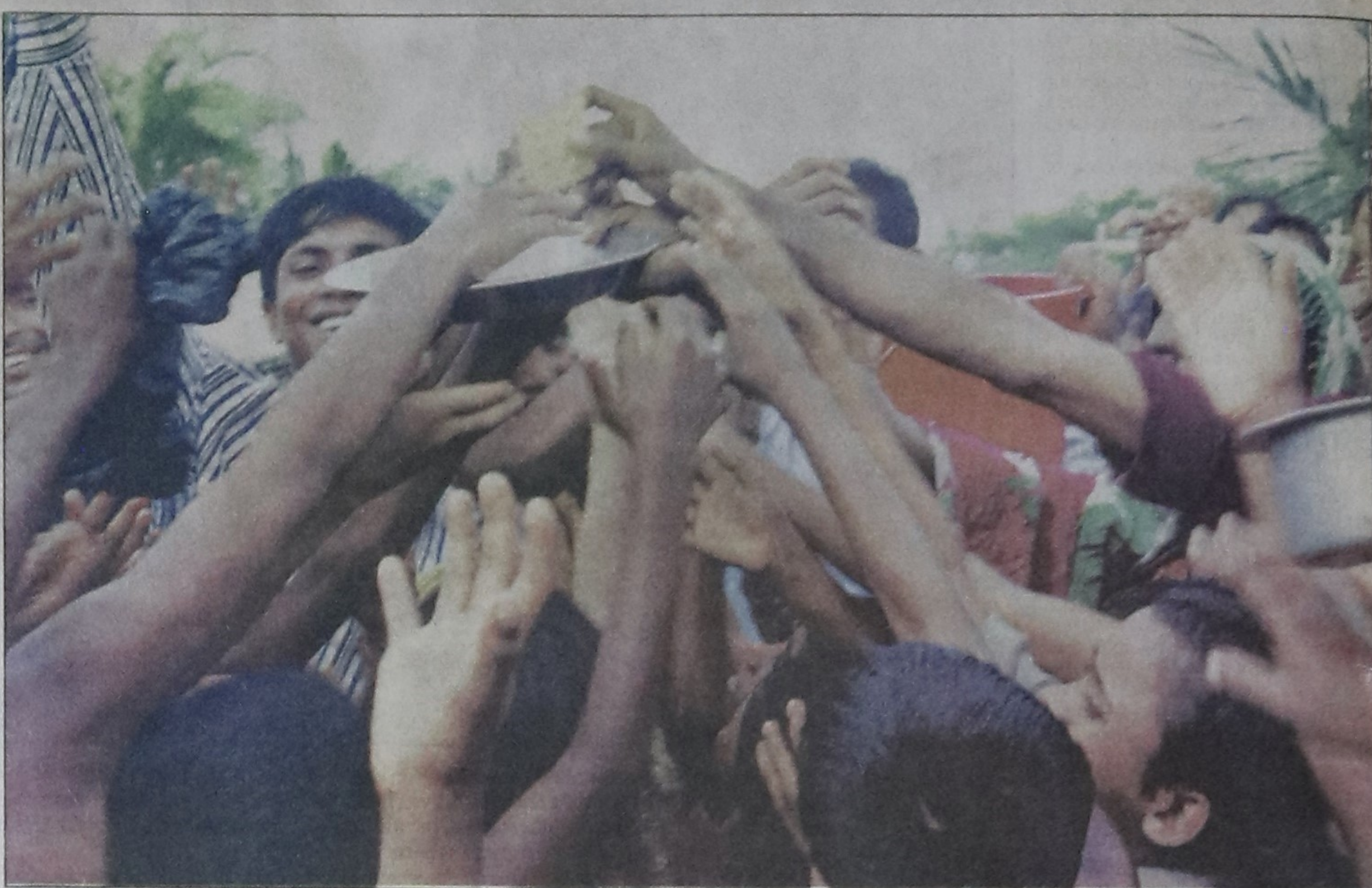
Flood-hit people squabble over high-protein biscuits distributed by Concern Bangladesh, an NGO, at Shatani Primary School relief centre in Satkhira sadra yesterday.

The grant will be utilised for import of commodities and equipment especially for power plant and much needed investment programmes like chemicals, lubricants machinery, cotton, vehicles, pumps and spare parts.