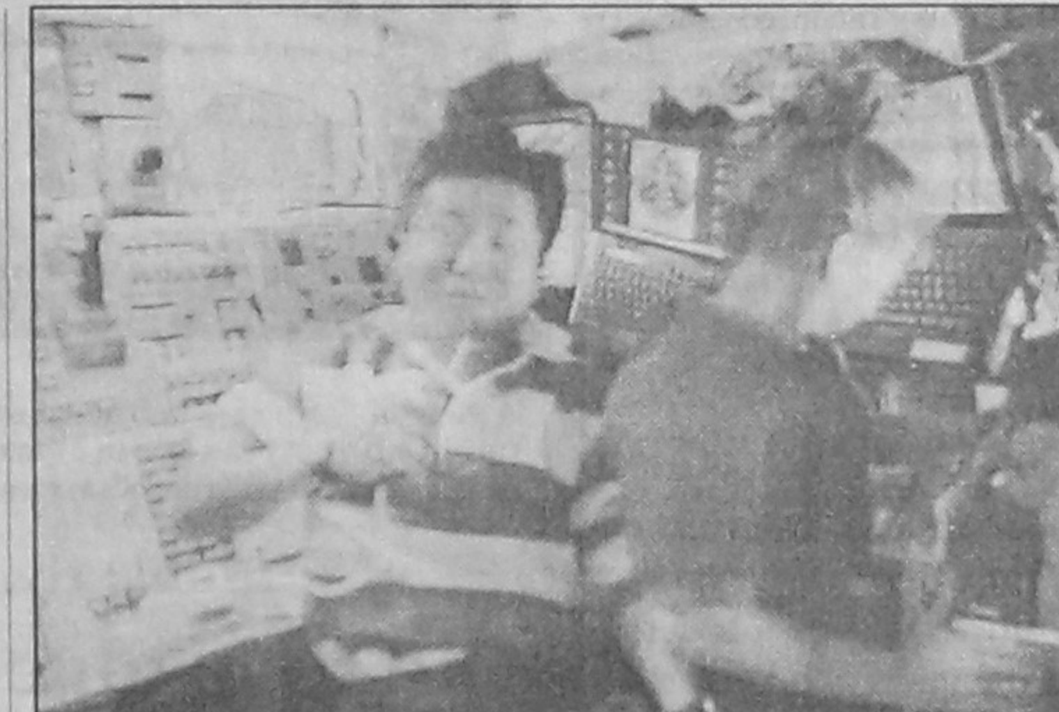
US space shuttle Discovery Japanese Mission Specialist Koichi Wakata (L) talks about the days events on Saturday from the shuttle's flight deck as US Pilot Pam Melroy (R) checks some data. Wakata used the robot arm to install the Z-1 truss to the Unity Module after the crew overcame some minor glitches.

Voters are to choose from 550 candidates running for the 110-seat lower chamber House of Representatives. The small but vocal opposition in the former Soviet state are boycotting the poll, saying the assembly is powerless and the authorities blocked them from equal access to state-run mass media.