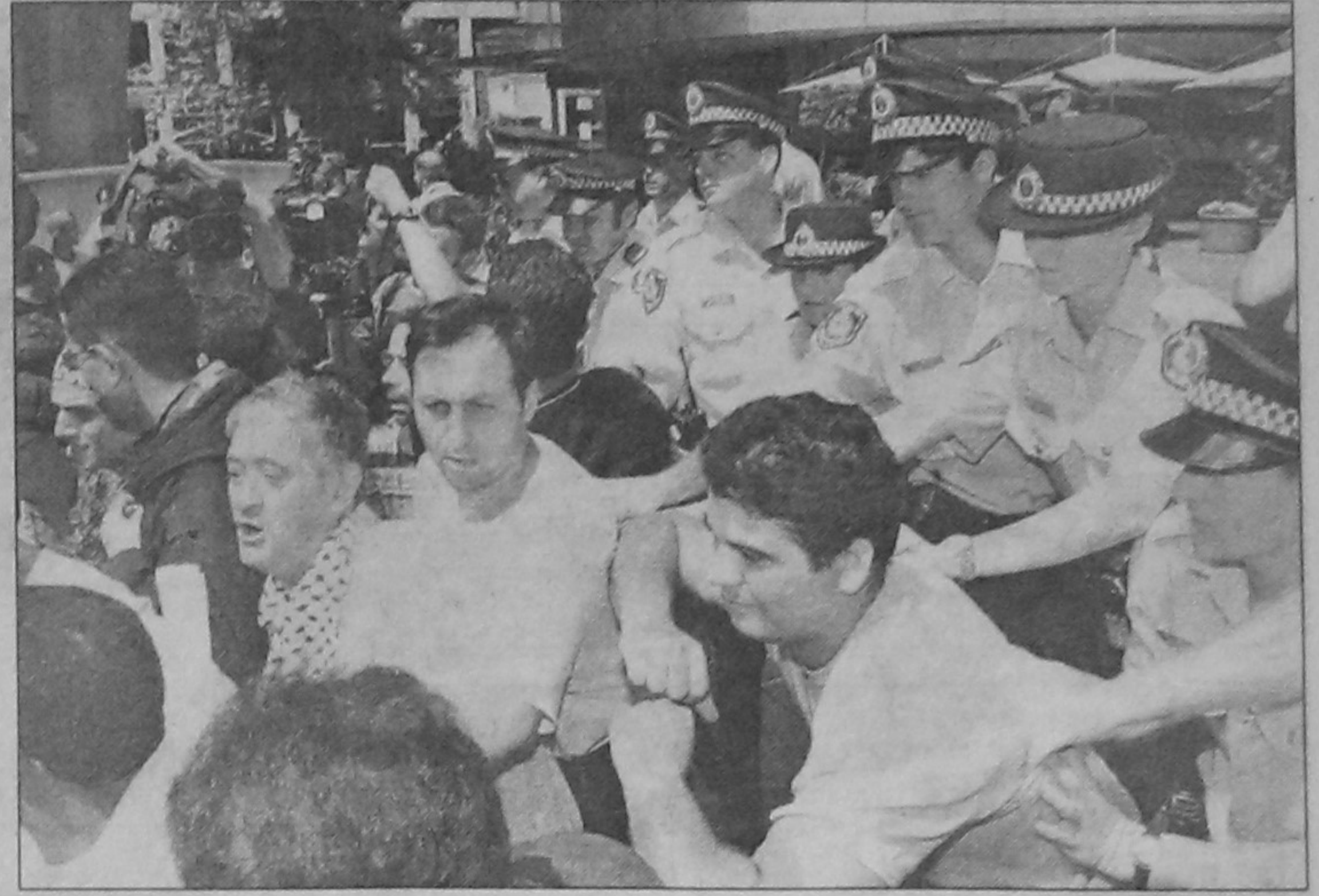
Palestinian rally organisers, with the help of the New South Wales Police Force, attempt to hold back demonstrators trying to storm the US consulate in Sydney yesterday. The protest was organised by an umbrella grouping of local Palestinian, Arab and Muslim organisations in response to the crisis in the Middle East.