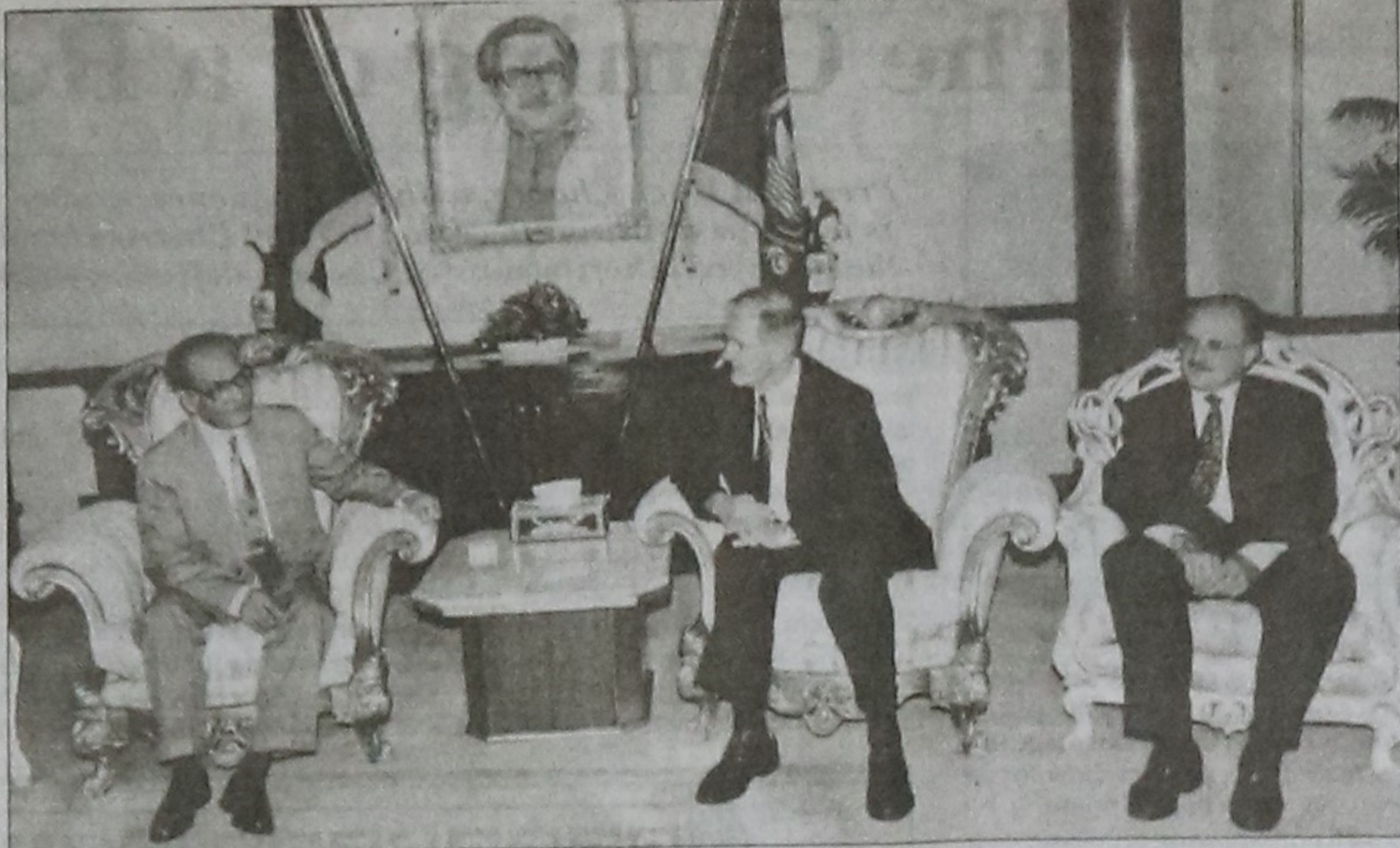
Visiting Foreign Minister of Switzerland Joseph Diess called on President Shahabuddin Ahmed at Bangabhaban yesterday.

Please contact: MANAGER (P&A) RANGS GROUP, RANGS BHABAN, 113-116 OLD AIRPORT ROAD, DHAKA-1215. Ph: 9129536-38, 8120001-4