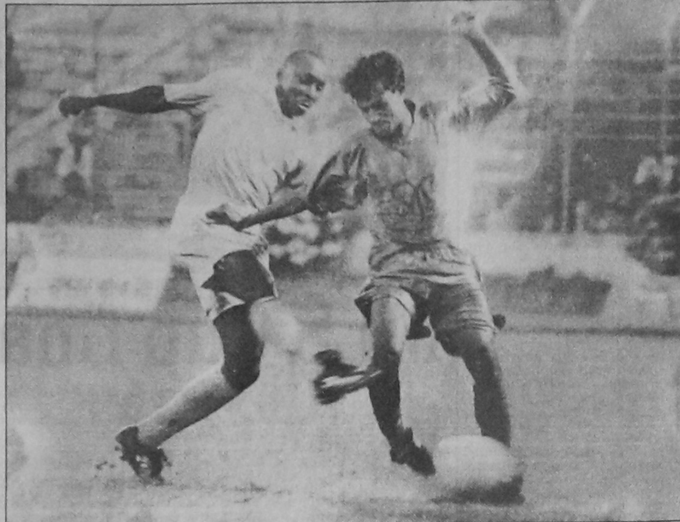
Scene from yesterday's National Bank Premier Division Football Relegation League match between Brothers Union and Farashganj at the Bangabandhu National Stadium.

Pollock said the start in the bowling was fine as far as South Africa was concerned. "I thought our start was just fine, but Saurav took off when Niki Boje came in. He hit all those sixes and helped his side reach a huge total."