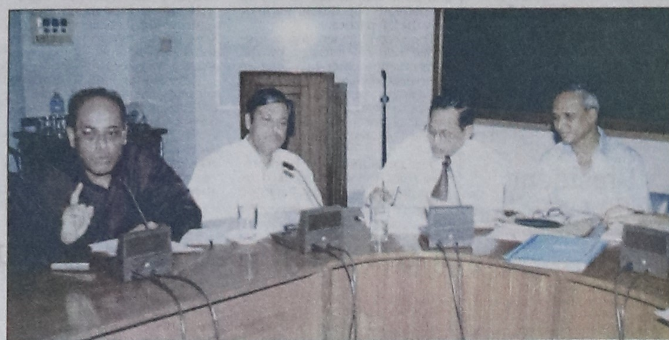
The Daily Star roundtable on 'Fallacy of Free Medical Treatment for a Genuine People's Healthcare' in progress at the auditorium of the Press Institute of Bangladesh (PIB) in the city yesterday.