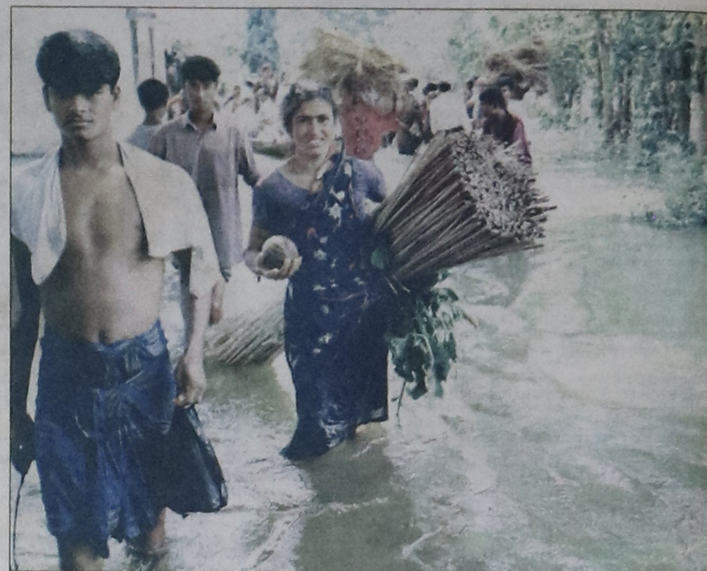
Flood-hit people of Baikali Union in Satkhira sadar upazila moving to safer places, breaking through knee-deep water.

A case was filed with Mohammadpur thana in this connection.