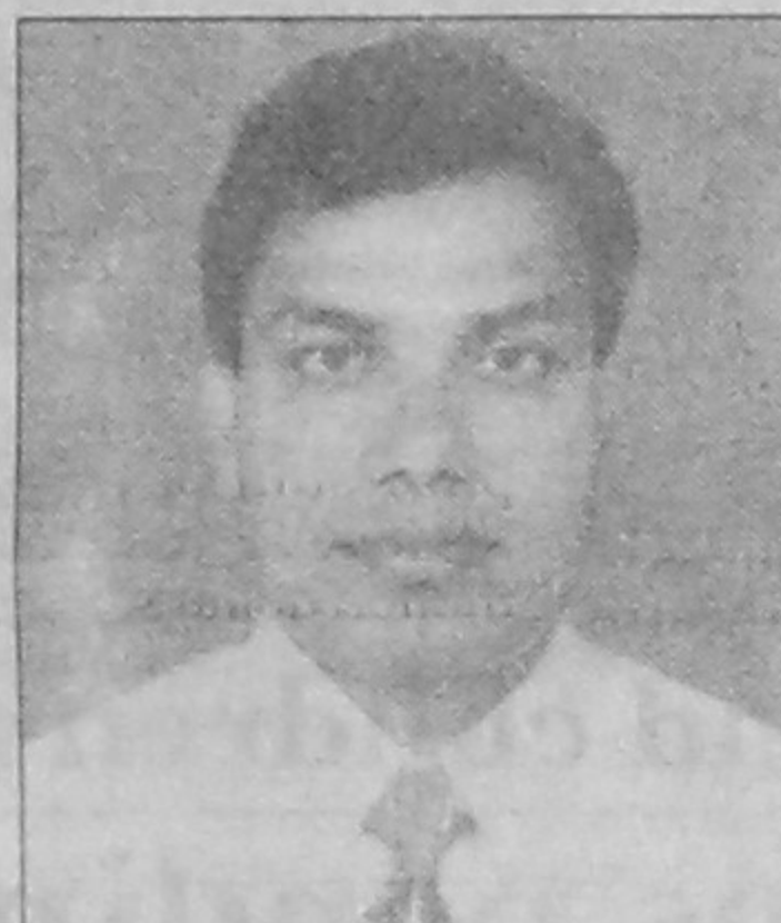
From Our Correspondent