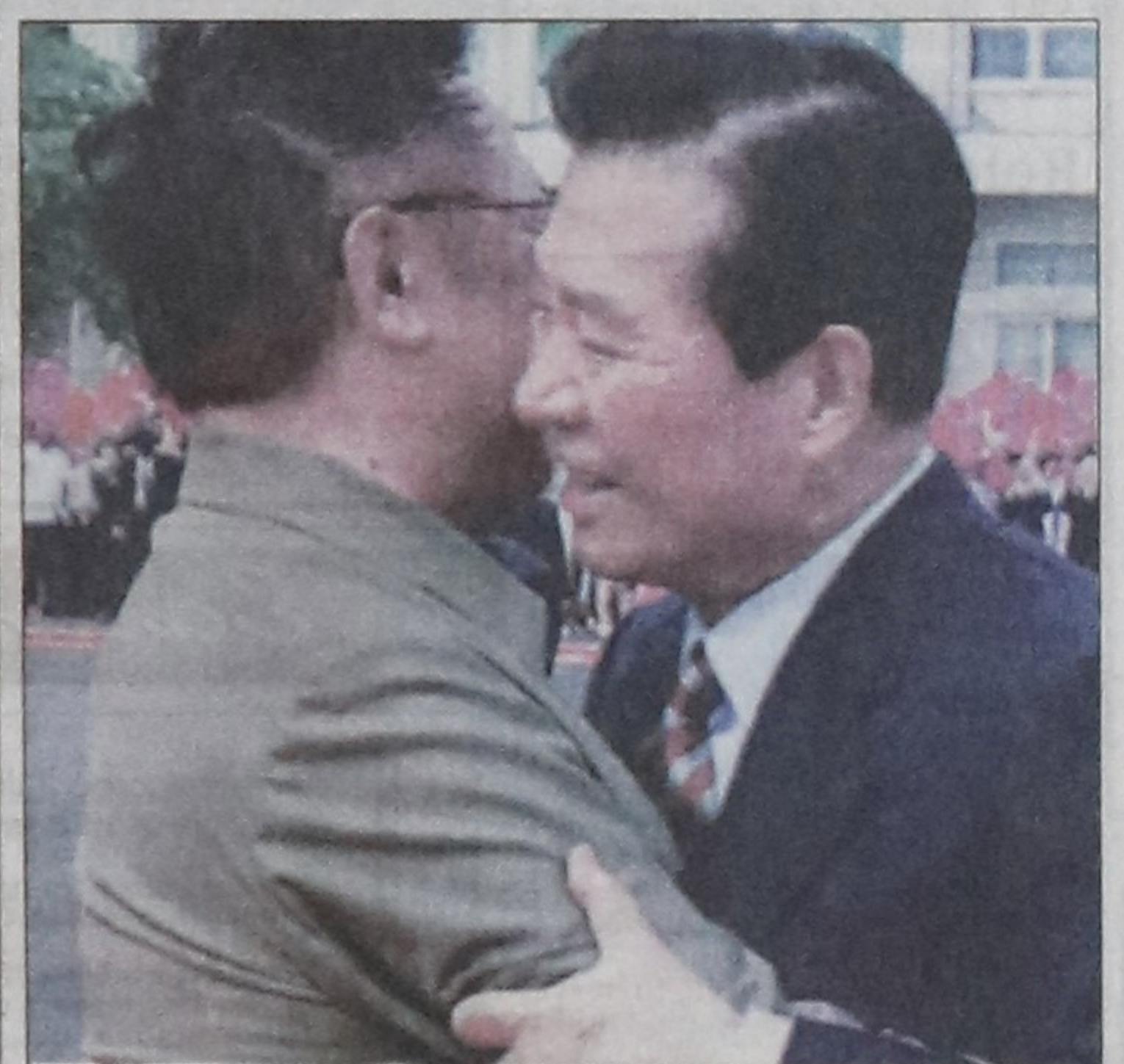
shows Kim Dae-jung (R) embracing Kim Jong-Il on June 15, 2000 before leaving Pyongyang after the historic summit. Kim Dae-jung was awarded the Nobel Peace Prize yesterday for his reconciliation efforts but the latter's role was simply 'recognised.'