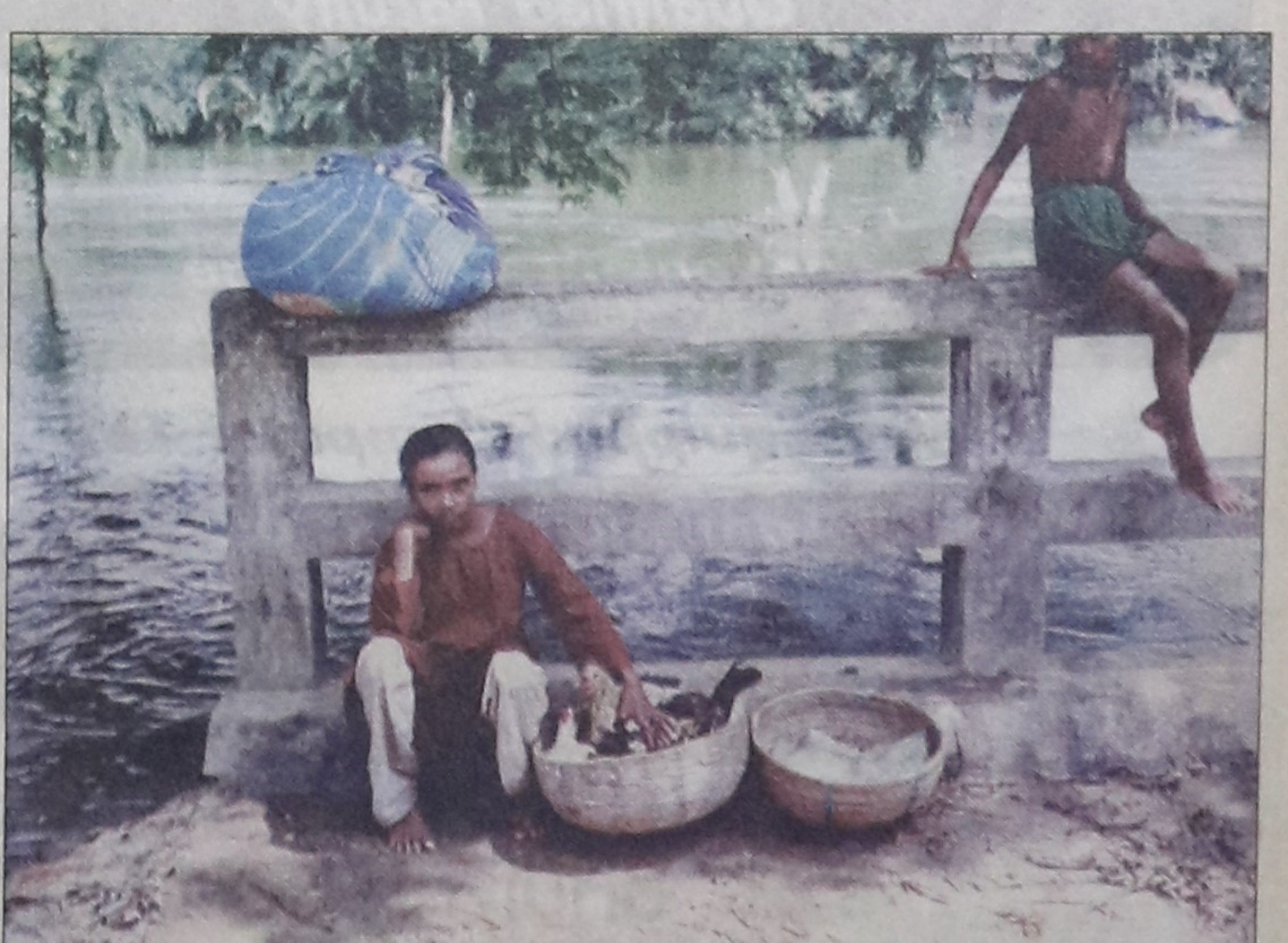
Fleeing from the floodwaters in Satkhira that rendered her homeless, a young girl, with her last belongings wrapped in a bed sheet and her few chickens, stops on a culvert to catch her breath; there may be a long journey ahead.