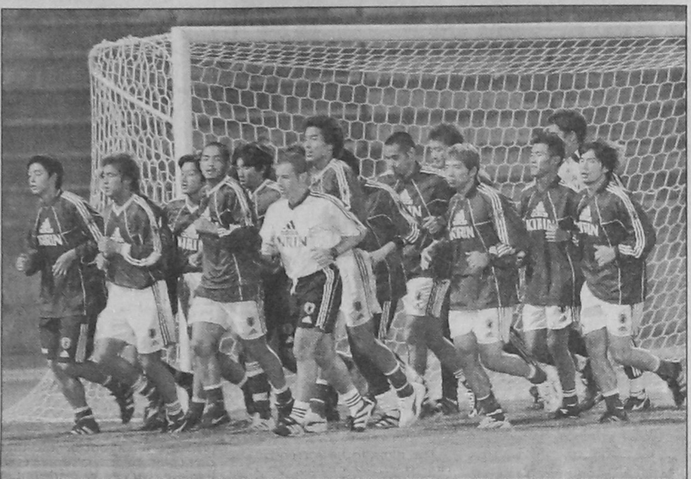
Japanese footballers warming up during a training session at the Municipal Stadium in Beijing on October 11.

The England job... under no circumstances!