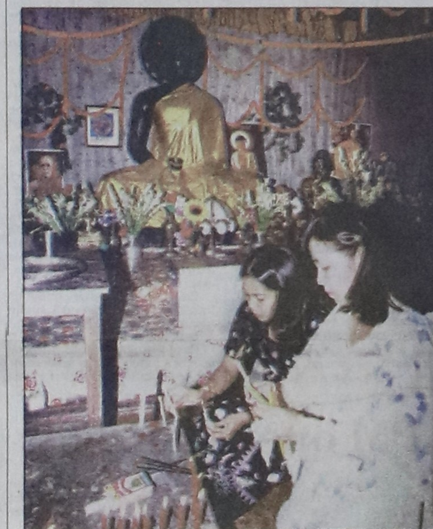
Two young Buddhist women light candles at the altar inside the Kamalapur Buddha Bihar in the city yesterday in observance of the Probarona Purnima.