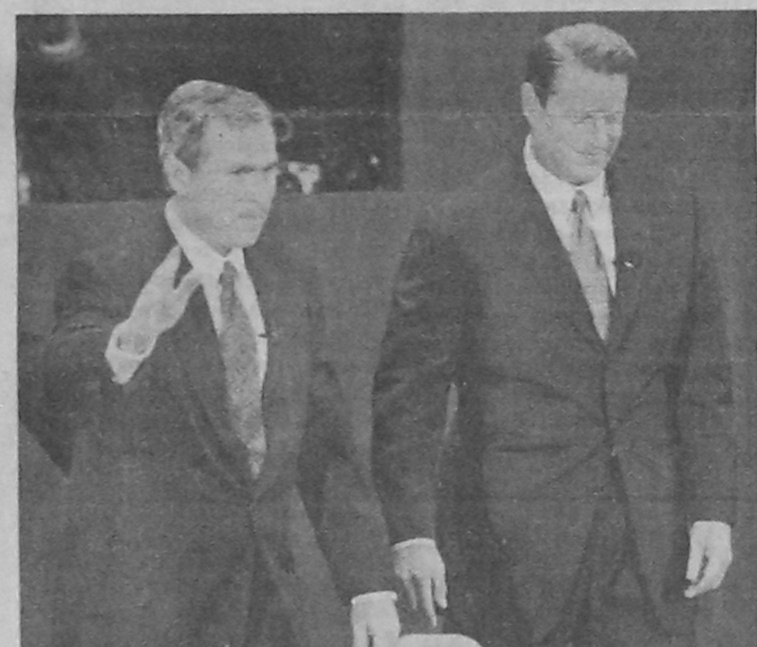
Republican presidential nominee George W. Bush (L) waves as he and Democratic presidential nominee Al Gore (R) take the stage before starting their second debate, in Wait Chapel at Wake Forest University in Winston-Salem, NC, on Wednesday.

WINSTON-SALEM, North Carolina, Oct 12: Al Gore and George W. Bush both declared strong support for Israel and called on PLO Chairman Yasser Arafat to restrain the violence rocking the Mideast Wednesday night as they stepped gingerly around foreign policy issues in a nationally televised campaign debate, reports AP. Gore also called on the Syrian government to press for the release of three Israeli soldiers who have been captured by Hezbollah militia forces in Lebanon, where Syria is the main power. Through the first half hour of their 90-minute second debate, the two presidential hopefuls disagreed over several past US interventions abroad and sparred over the Clinton administration's handling of Iraqi leader Saddam Hussein. The rivals, locked in a tight, back-and-forth race for the White House, met on a stage at Wake Chapel on the campus of Wake Forest University. They have a final debate next week. Their