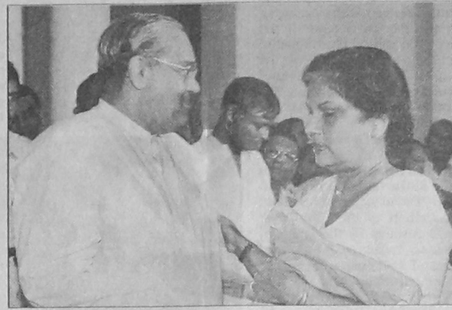
Sri Lankan President Chandrika Kumaratunga (R) and her estranged brother Anura Kumara Dissanayake (L) joined in Buddhist religious rites yesterday at the funeral of their mother and former prime minister Sirima Bandaranaike. Bandaranaike, 84, died of a heart attack on October 10 shortly after casting her vote for the parliamentary elections.

minority Tamil groups. Kumaratunga's party was left just six seats short of the required 113 MPs needed to form a government on its own and the horse-trading looked set to begin. But the PA claimed victory and PA leader S. B. Dissanayake said he was confident of forming a minority government with the help of a regional Tamil party, the Eelam People's Democratic Party (EPDP), which won four seats in the Jaffna peninsula.