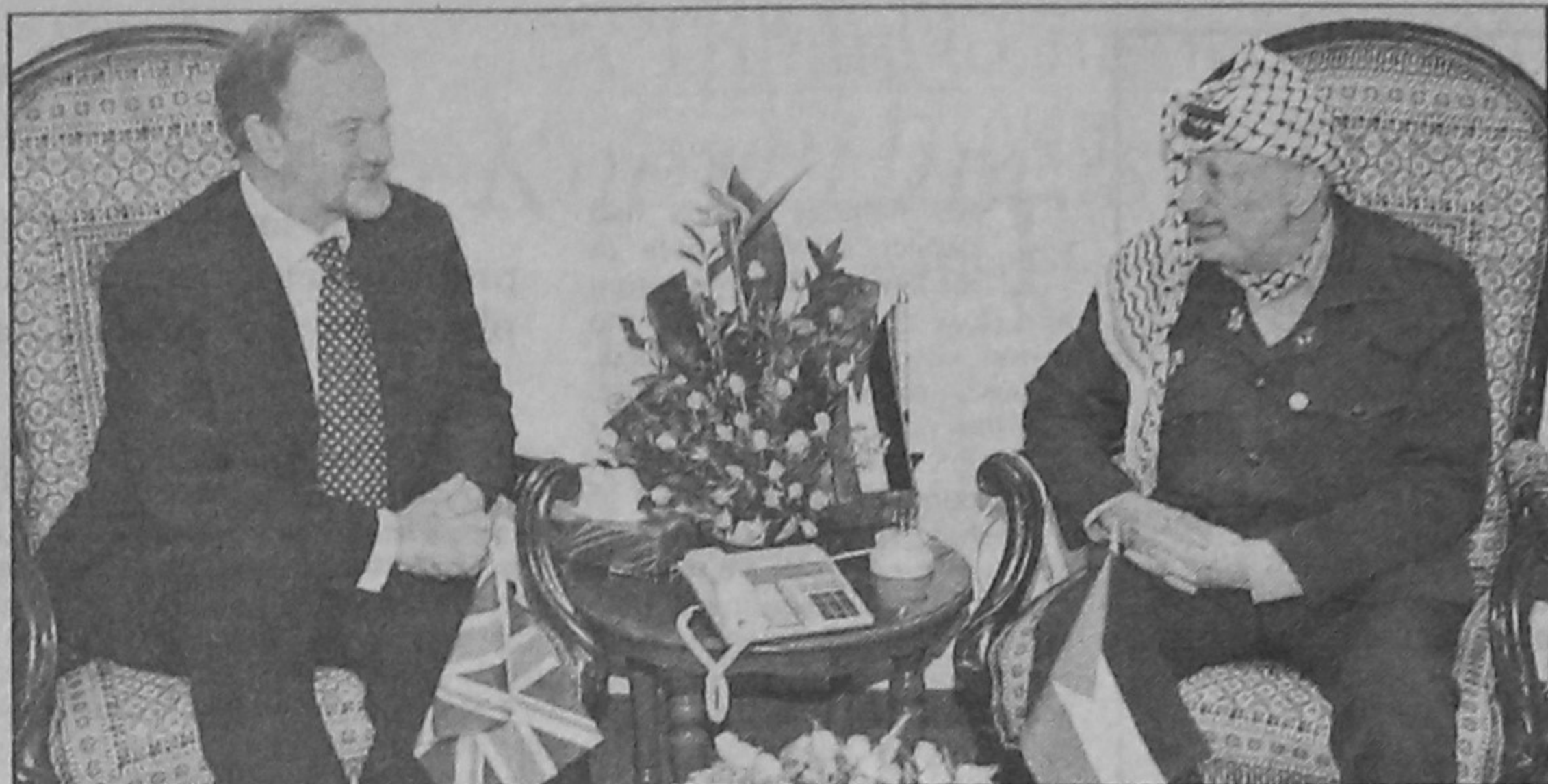
Palestinian leader Yasser Arafat (R) meets with British Foreign Secretary Robin Cook in Gaza City on Wednesday. Cook arrived to land his diplomatic weight to international peace efforts in the Middle East.

sides, Israeli security forces are not allowed into areas under complete Palestinian control unless by prior agreement. The centre of the town was in chaos, as two Israeli helicopter gunships and a reconnaissance plane were flying low over the town, the correspondent said. Schools had closed down, and people were boarding up their homes and shops fearful of further violence and retaliation by Israeli troops. A long line of traffic was heading out of the town, an AFP photographer said. An AFP photographer was also assaulted by the crowd in the ensuing chaos. Ramallah has been a flashpoint in a wave of violence over the past fortnight that has killed more than 100 people, the vast majority Palestinians.