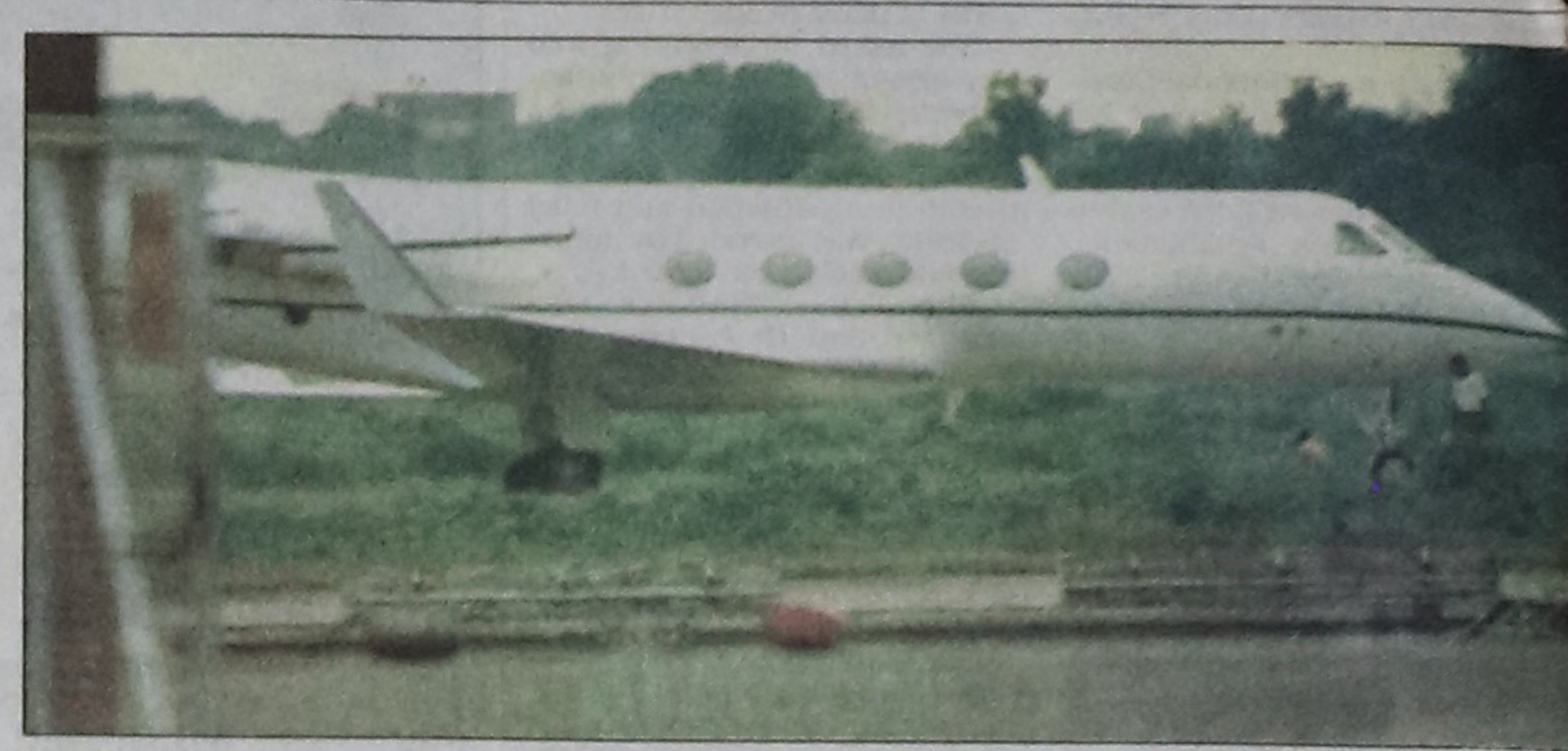
The Saudi Arabian executive jet made a heavy landing at ZIA after its wheels caught fire yesterday.