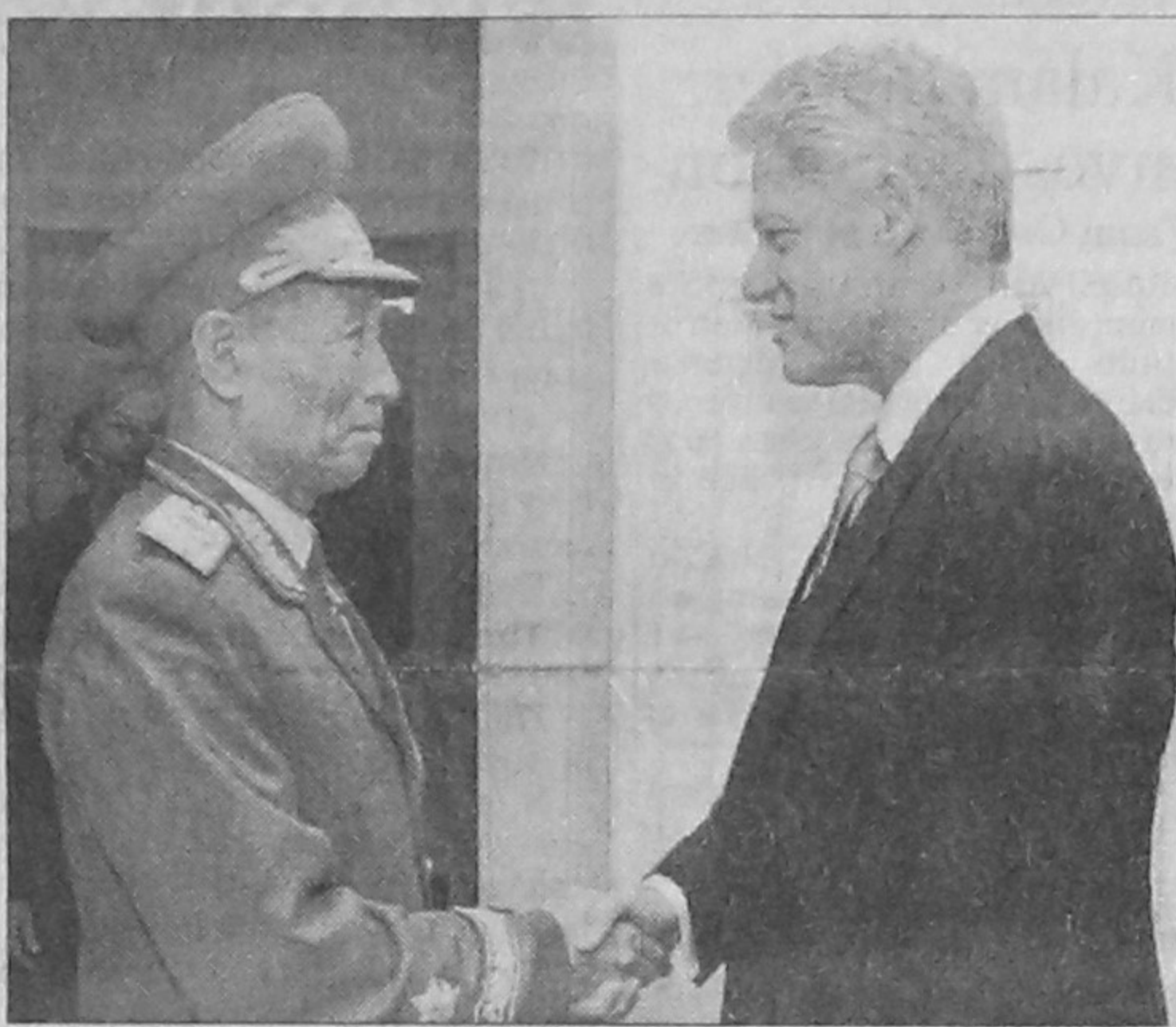
US President Bill Clinton (R) greets North Korean Vice-Marshal Jo Myong-Rok at the Oval Office in the White House on Tuesday. Jo is the highest-ranking North Korean official to ever visit the US. The two met for 45 minutes.

"This was an excellent start," Ambassador Wendy Sherman, coordinator of US policy toward North Korea, told reporters. She said both sides summarised their positions in a meeting that was more ceremonial than substantive.