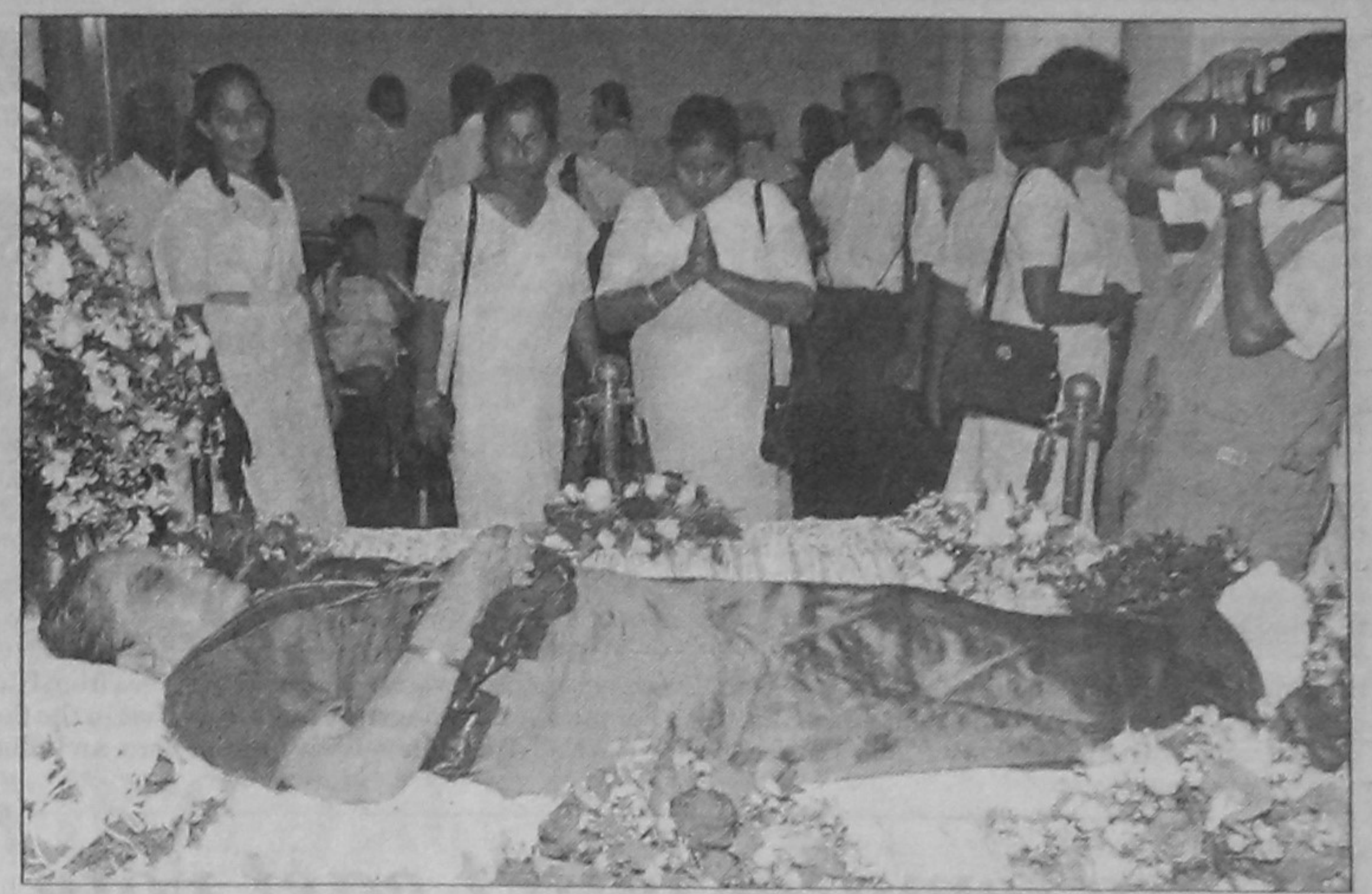
Sri Lankan women pay their respects during a wake for the country's matriarch politician Sirima Bandaranaike at her residence in Colombo yesterday. Bandaranaike will be buried with full state honour in Horagolla on October 14. Bandaranaike, the world's first woman prime minister, died on Tuesday at the age of 84, shortly after casting her vote in parliamentary elections.

The Tezpur chilli beat them all with the value of 855,000 SHUs, according to researchers at the Defence Research and Development Establishment in Gwalior.