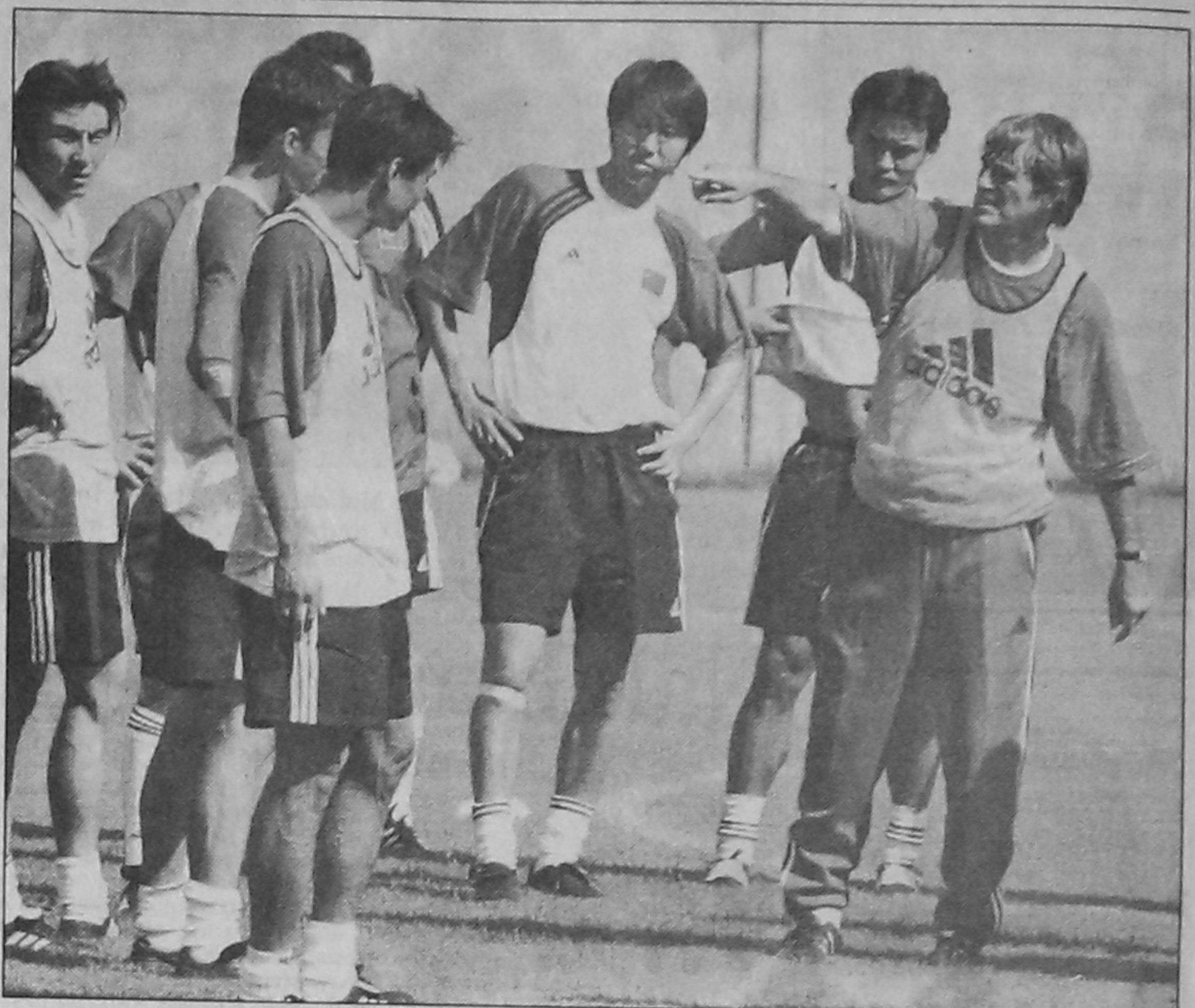
China's football coach Bora Milutinovic (R) trying to draw the attention of his players to something during a practice session at the Tripoli Stadium in Beirut yesterday. The team is currently in Lebanon to participate in the Asian Cup which begins tomorrow.

Georgia arrived in Ancona on Monday and will be looking to their chief creators Georgi Kinkladze and Temuri Ketsbaia to continue in the same vein after their stirring performances against Lithuania.