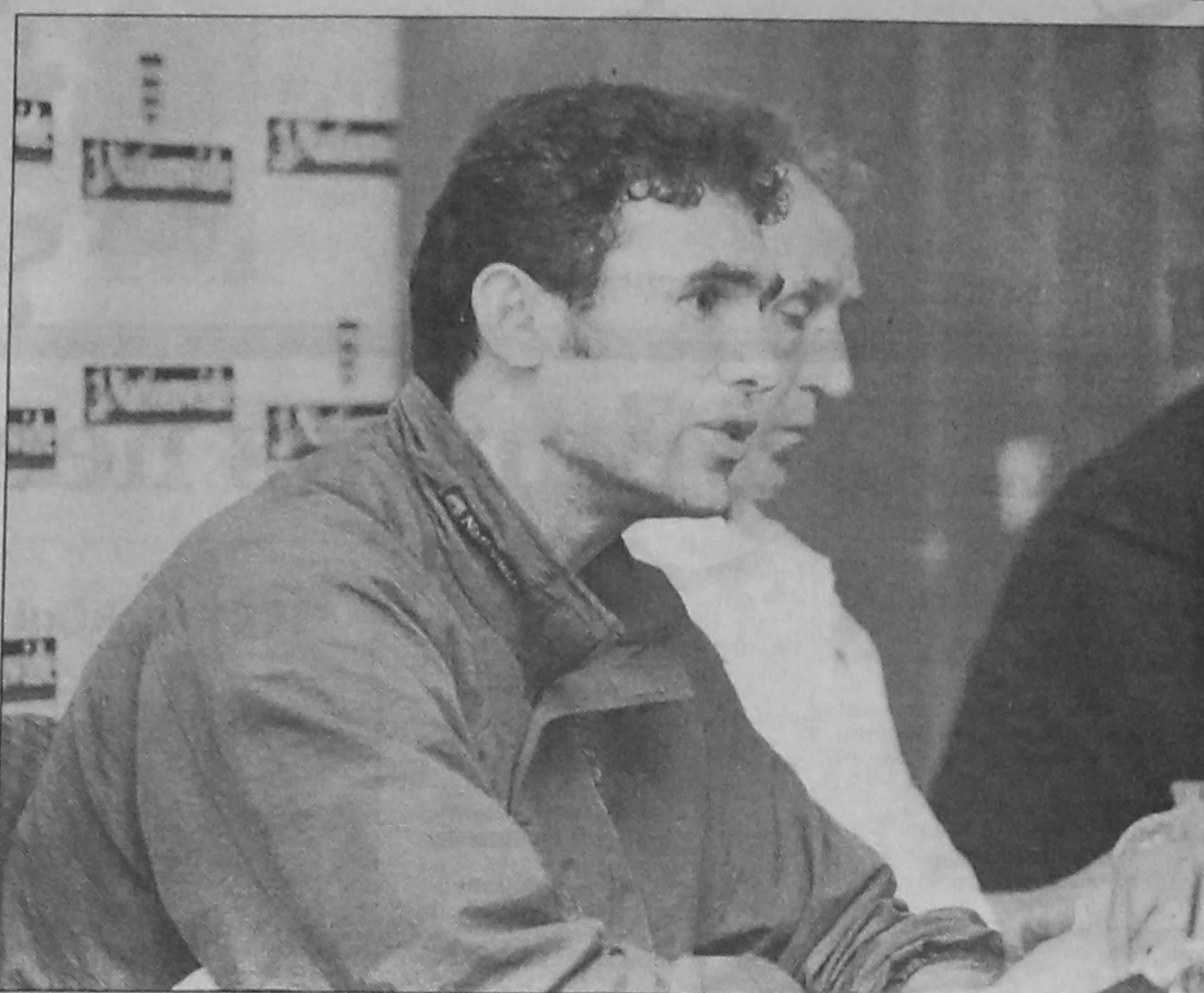
Newly-appointed England captain Martin Keown talking to reporters during a media conference in Helsinki on October 9 ahead of the World Cup against Finland. To his left is acting England manager Howard Wilkinson.

"In order to maintain the excellent relationship that we have enjoyed for the last five years, I would like to notify you of Naseem's decision to vacate the title."