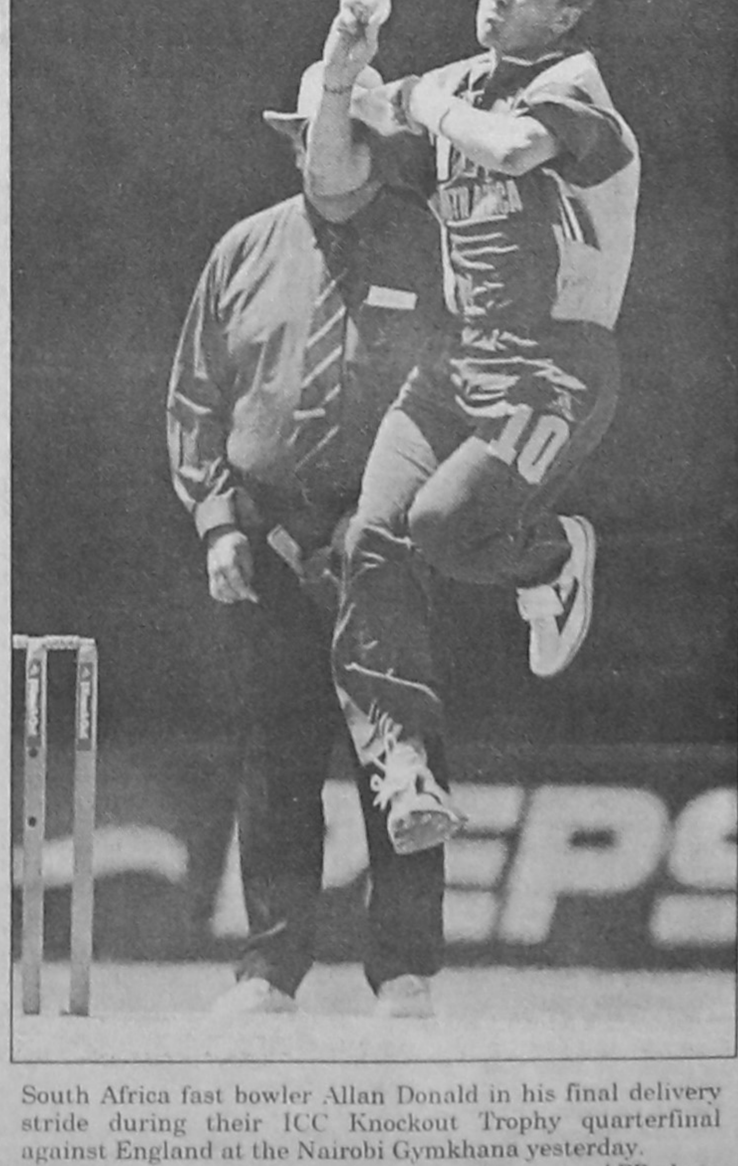
South Africa fast bowler Allan Donald in his final delivery stride during their ICC Knockout Trophy quarterfinal against England at the Nairobi Gymkhana yesterday.