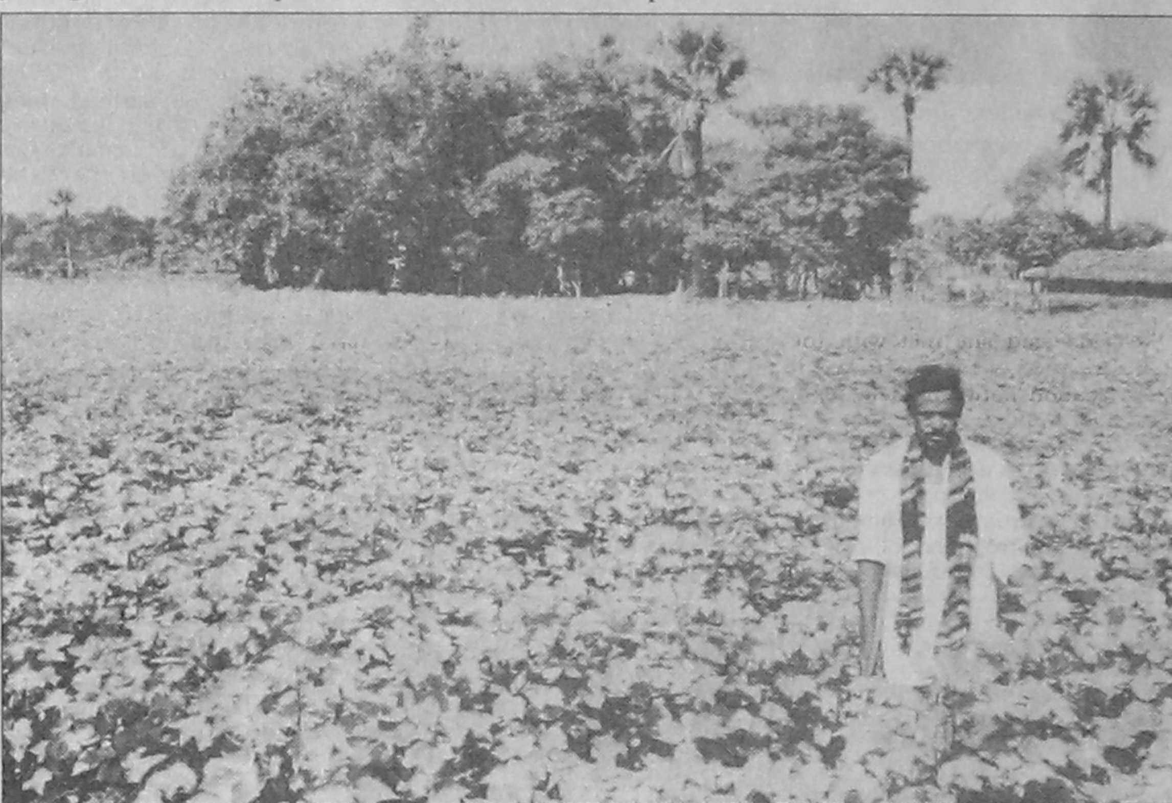
A massive programme of seed-cotton cultivation has been taken up in Rajshahi this season. Photo shows a farmer of Charchat area taking care of his produce.