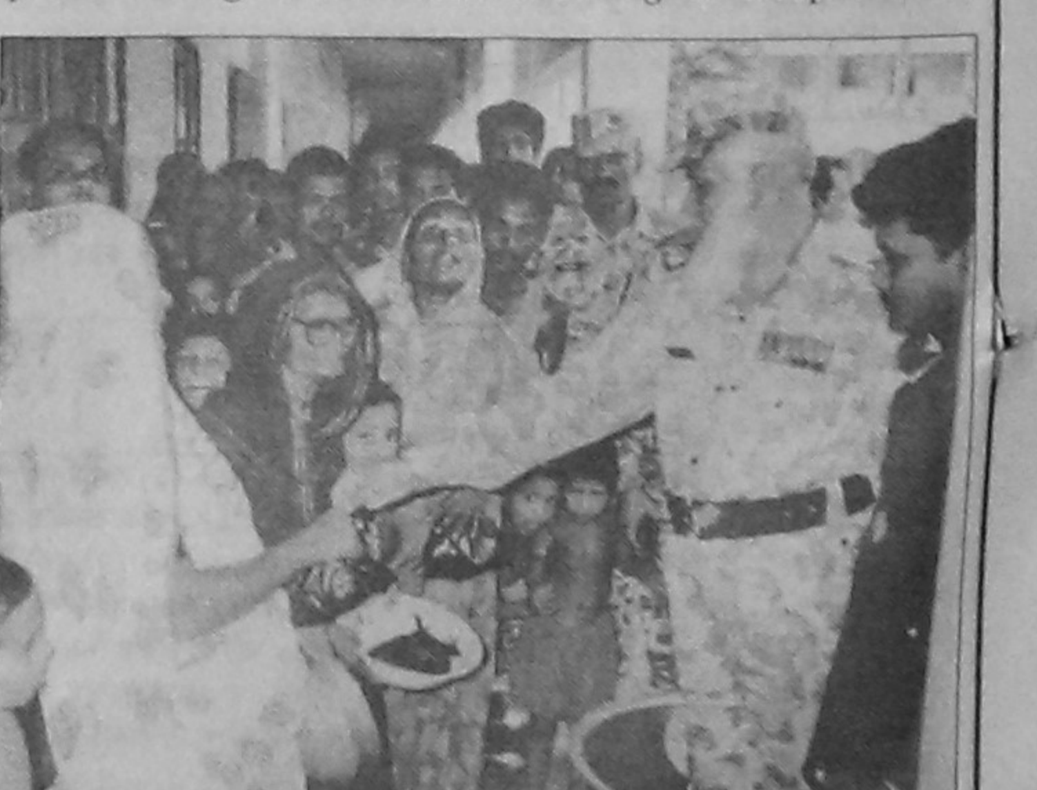
BDR personnel recently distributed relief goods among the flood affected people of Chapainawabganj, Rajshahi, Kushtia, Meherpur, Chuadanga, Jhenidha. BDR jawans are also engaged in rescuing the flood affected people.

Once Barogharia the coastal area of Mahananda river was famous for pottery but many potters of the area have given up their profession as they failed to earn their livelihood. They are passing their days in great hardships as the demand for pottery products has declined greatly with the modernisation of farming system. There is hardly any demand for household articles like earthen pots, jars, toys and sculpture due to the influx of plastic, aluminum and melamine products in the market, which is comparatively cheaper and long lasting. The potters have urged the authorities concerned to provide them with soft term loan facilities and adequate marketing facilities to continue their age-old occupation.