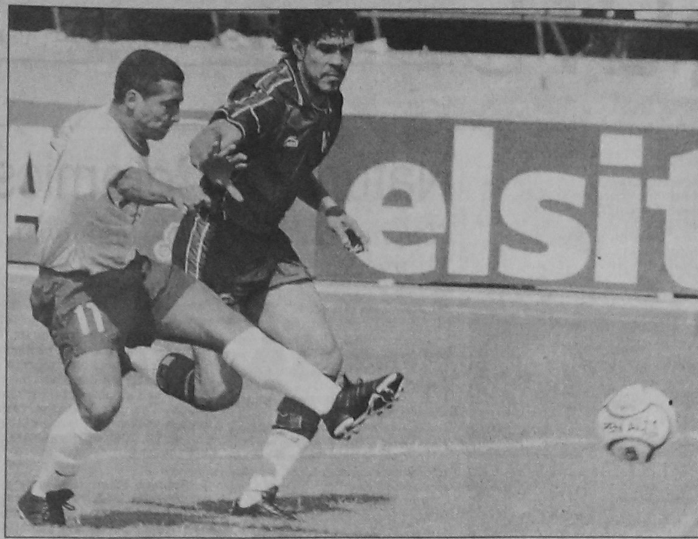
RAMPANT ROMARIO: Brazilian superstriker Romario (L), who struck four times, here shoots in his second against Venezuela during their World Cup qualifier at Venezuela on October 8.