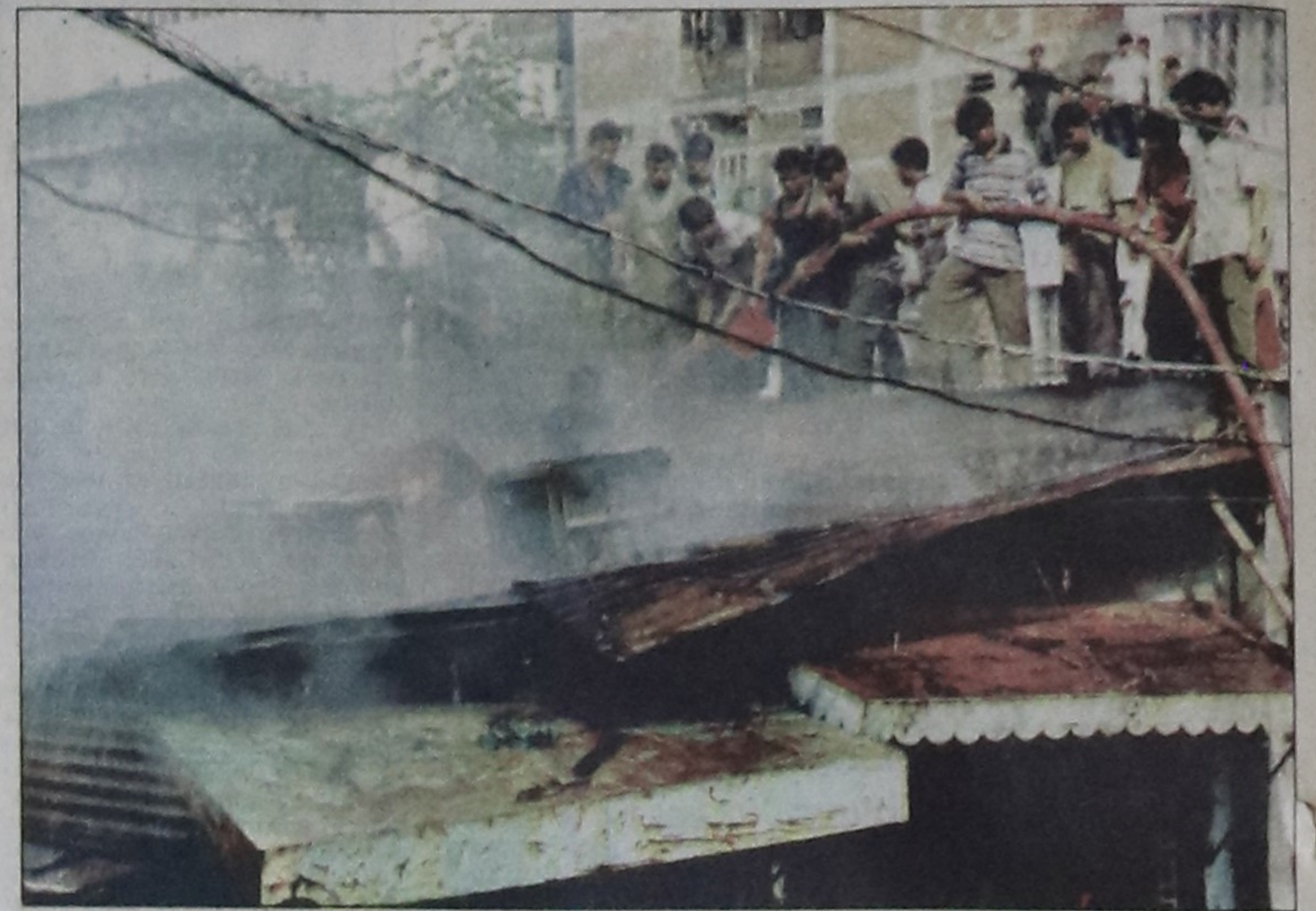
Fire from a short circuit gutted five electric and scrap shops at Haji Lal Mia Market at Dholaikhal in the city yesterday. Fire-fighters doused the fire in about an hour. No casualty was reported.

The Public Health Department has been instructed to ensure availability of safe drinking water. See page 11 col 5