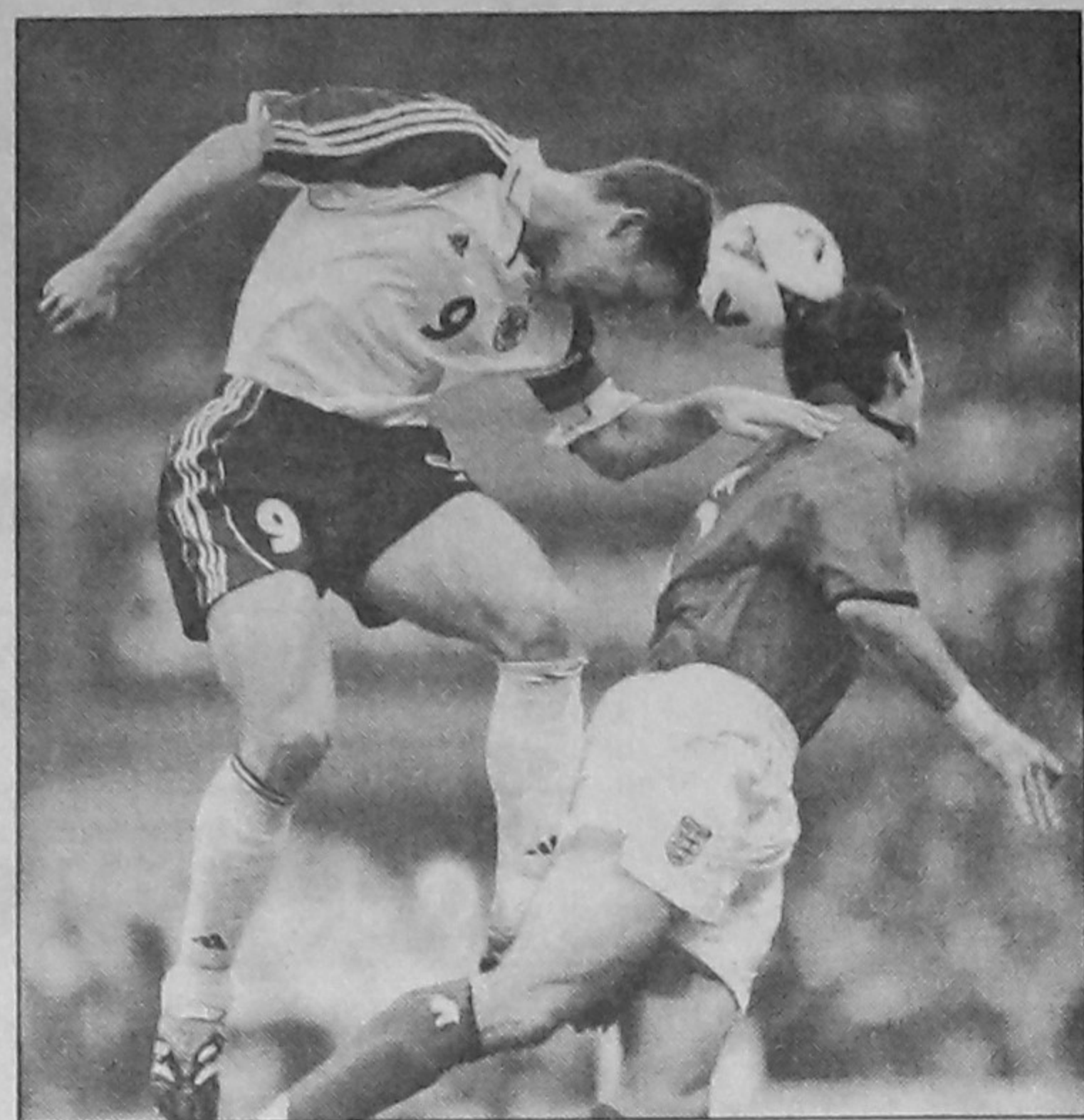
Germany's Oliver Bierhoff (L) and Martin Keown of England leap to head the ball during their World Cup qualifier at the Wembley Stadium on October 7.