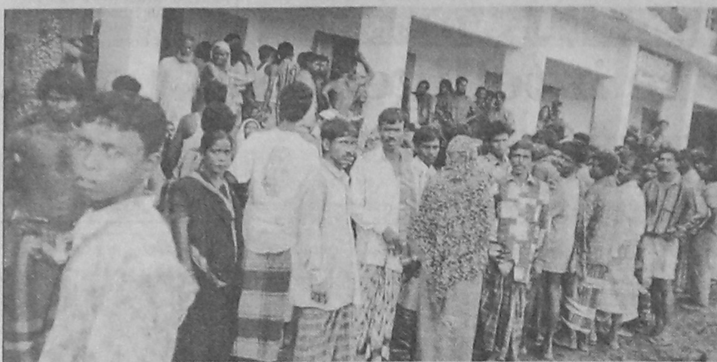
Flood victims throng for relief at Jibonnagar College flood shelter in Chuadanga district.

There is also allegedly massive irregularities and mismanagement in distribution of government relief materials.