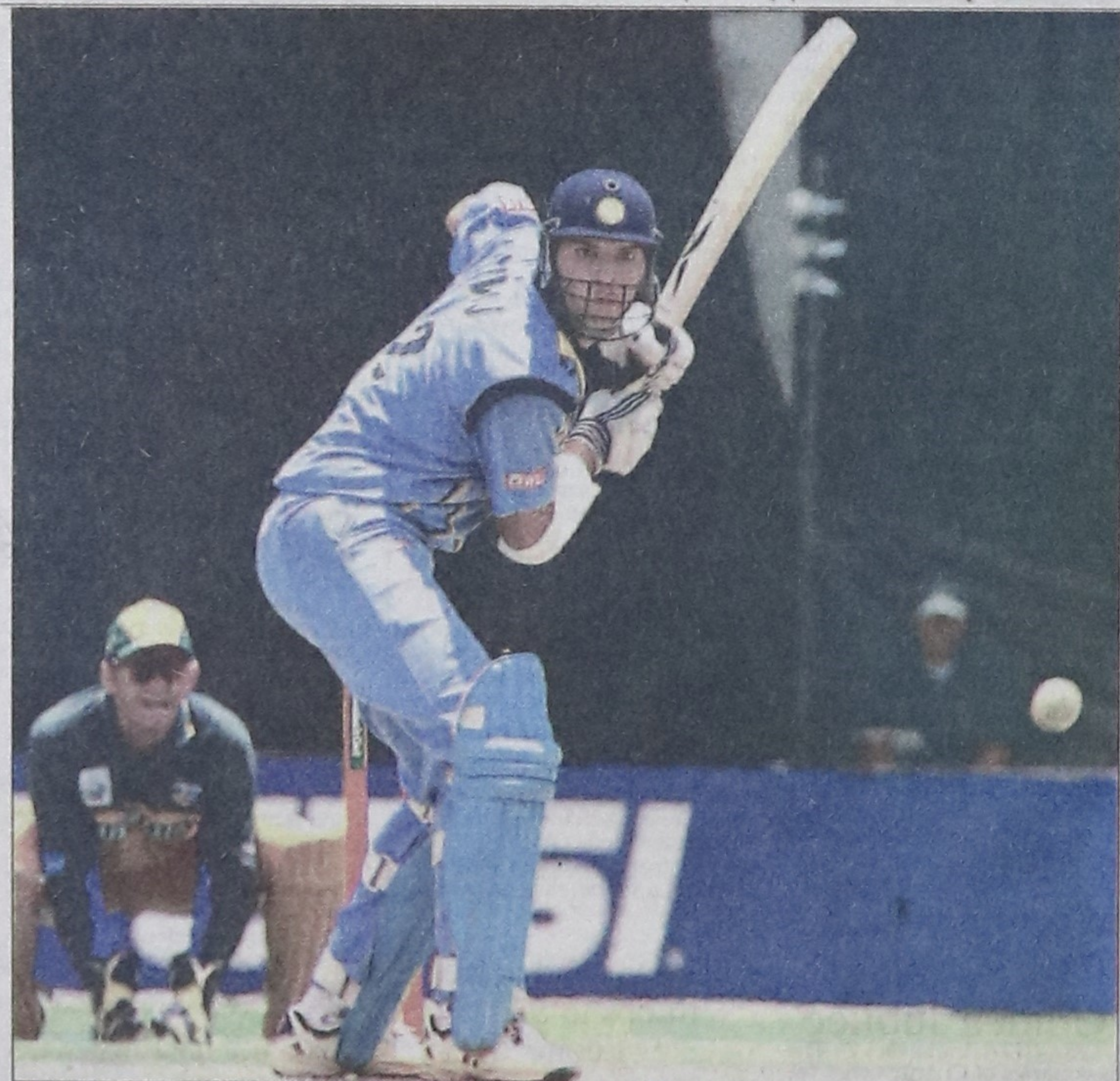
Indian new middle-order batsman Yuvraj Singh, who made a decisive 84 and was later adjudged man-of-the-match, prepares to have a go at a Brett Lee delivery during yesterday's ICC Knockout match against Australia in Nairobi.