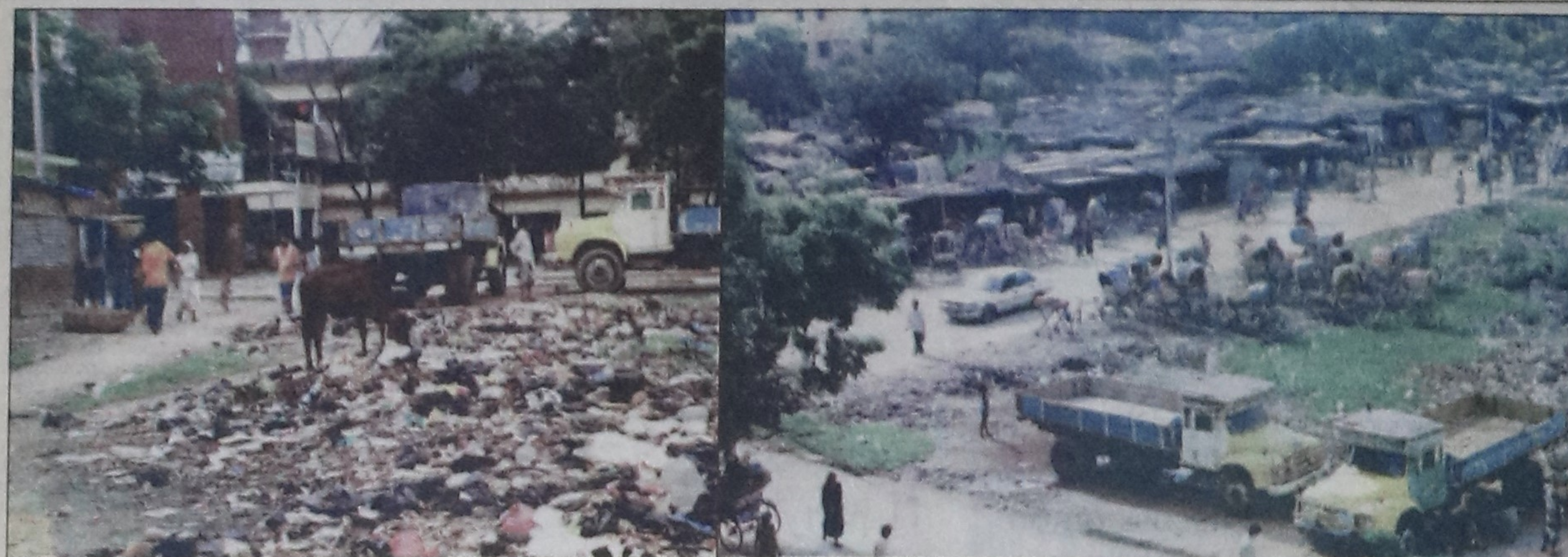
Loads of rubbish in front of the red-bricked NICRH complex at Mohakhali (left) and the burgeoning slum that has gobbled up a considerable portion of the hospital compound (right).