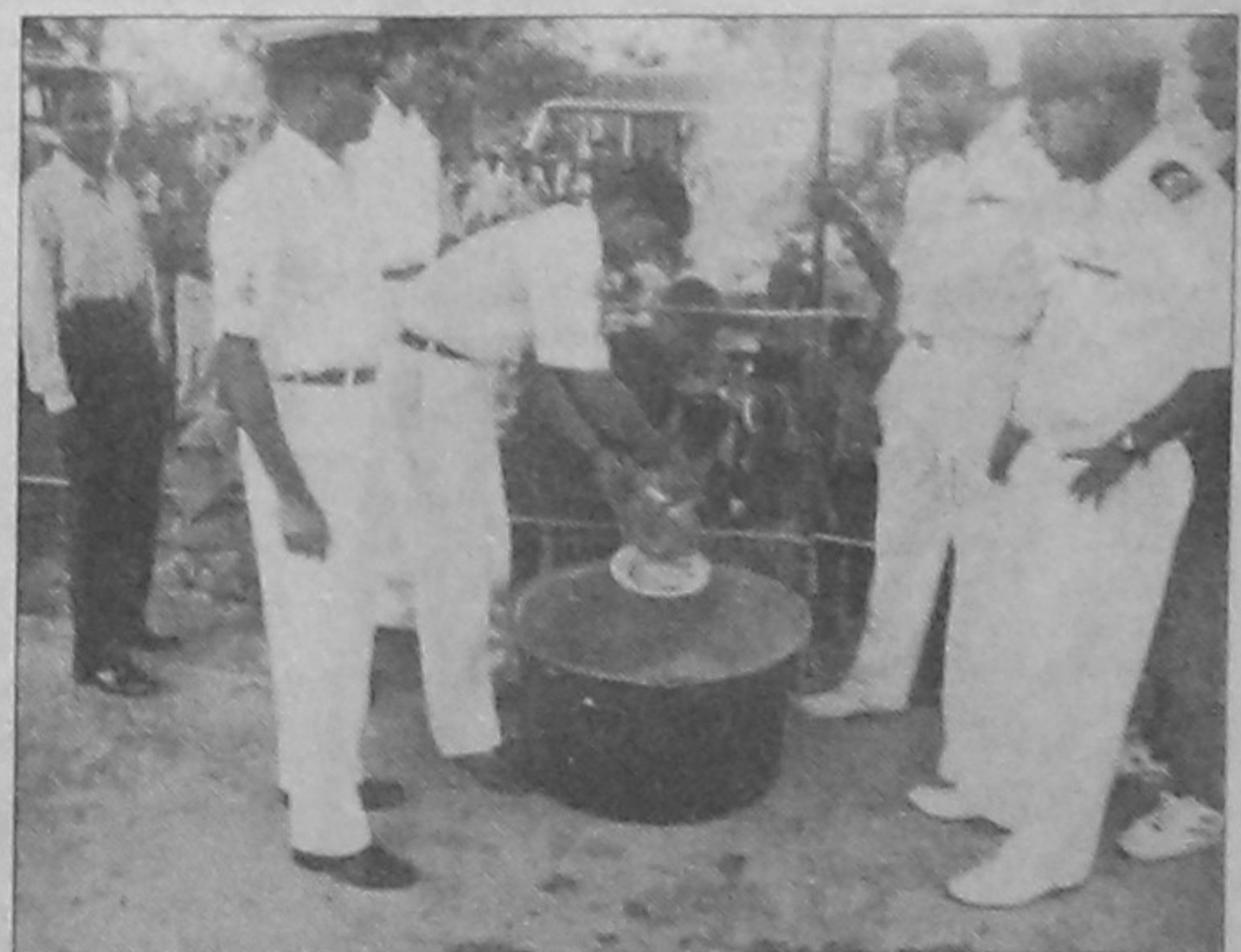
Bangladesh Navy relief team distributing cooked food at a flood relief centre in Jessore.

Shahidul Haq, 35, drowned while 12 other fishermen managed to swim ashore. The trawler sank south of Bayarchar at 1 am. They were going to fish in the Bay.