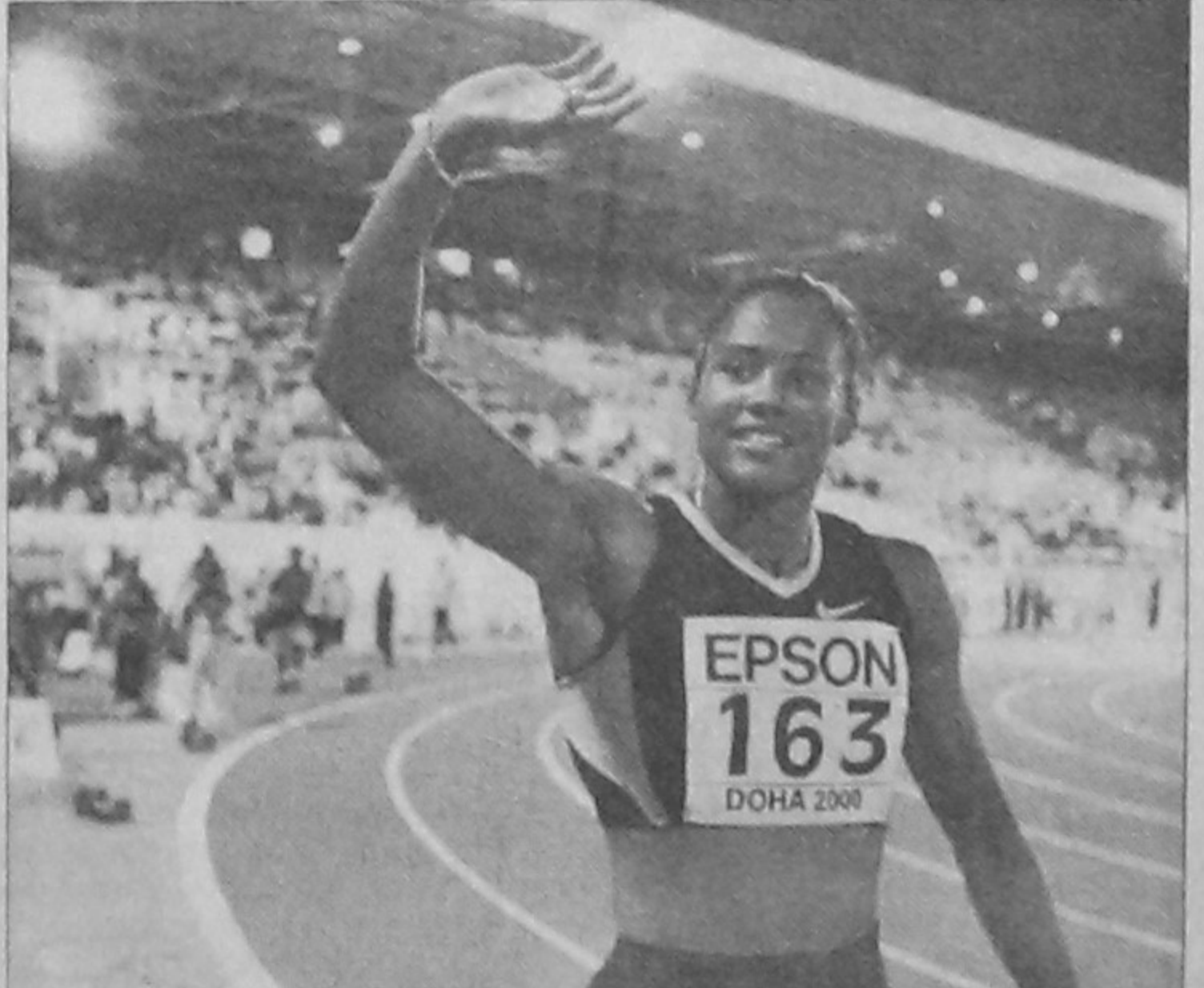
American Olympic champion Marion Jones waves after winning the 100m at the IAAF Grand Prix in Doha on October 5.