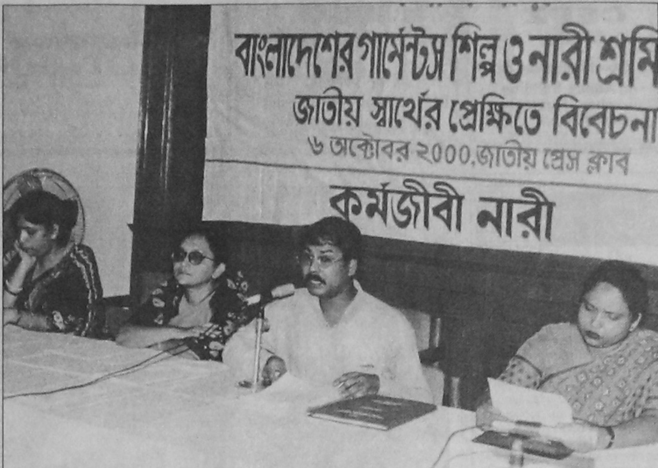
Karmajibi Nari organised a seminar on 'Garments Industry in Bangladesh and Women Labour Force: Consideration for National Interest Perspective' at the VIP Lounge of National Press Club in the city yesterday.