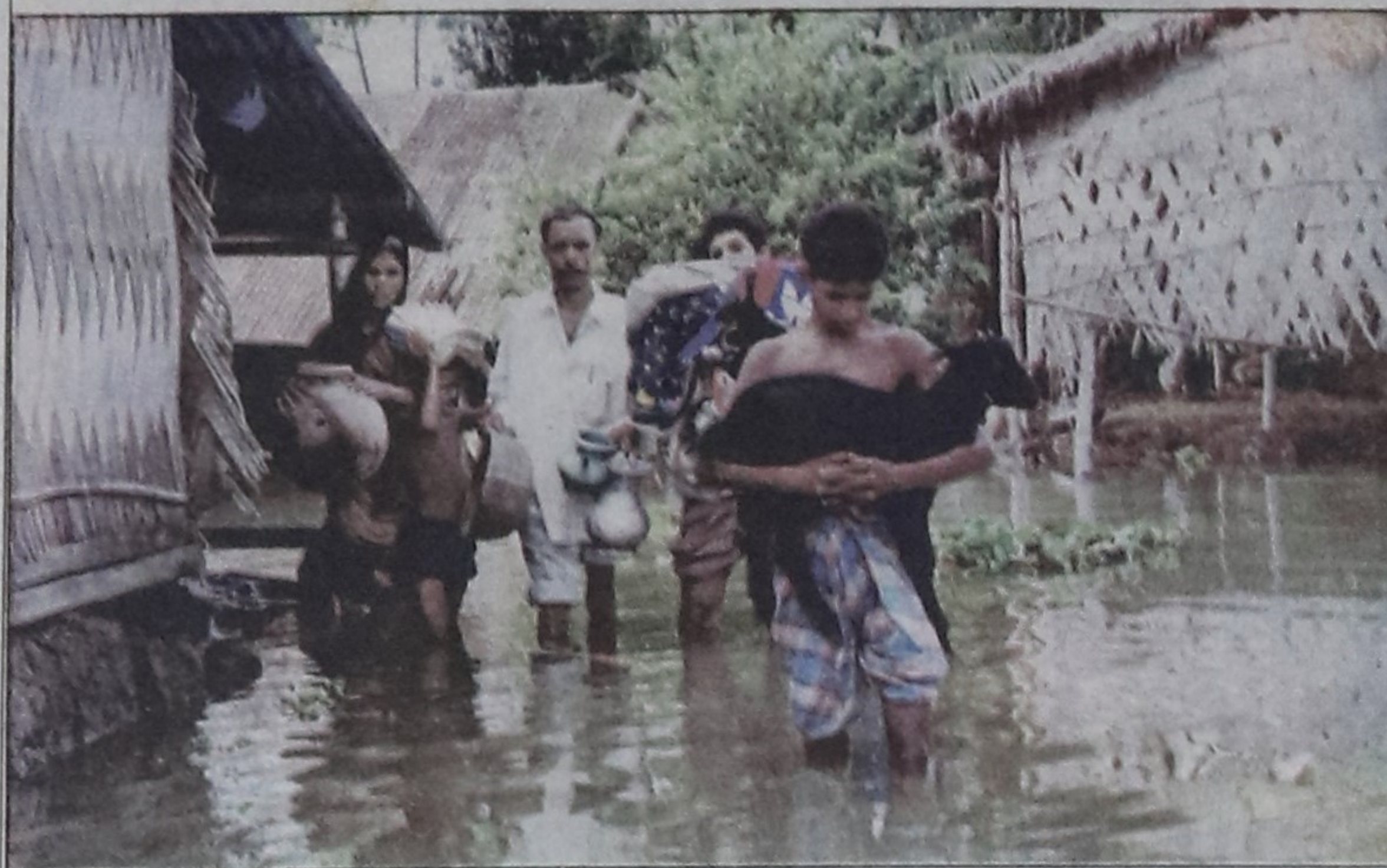
A vast area in the country's southwestern region is under water. As captured in the camera of Hossain Seraj, like many, the disaster has forced this family in Amuria village of Sadar upazila in Magura to move with whatever they could salvage, in search of high land (left) and some of the Bangladeshis stranded in India due to floods are seen braving their way into this side of the border as Bhomra land-port went under water (right).

From Benapoles, she will go to Puthkhal, one of the worst affected areas of Jessore district, by river and distribute relief materials among the flood victims.