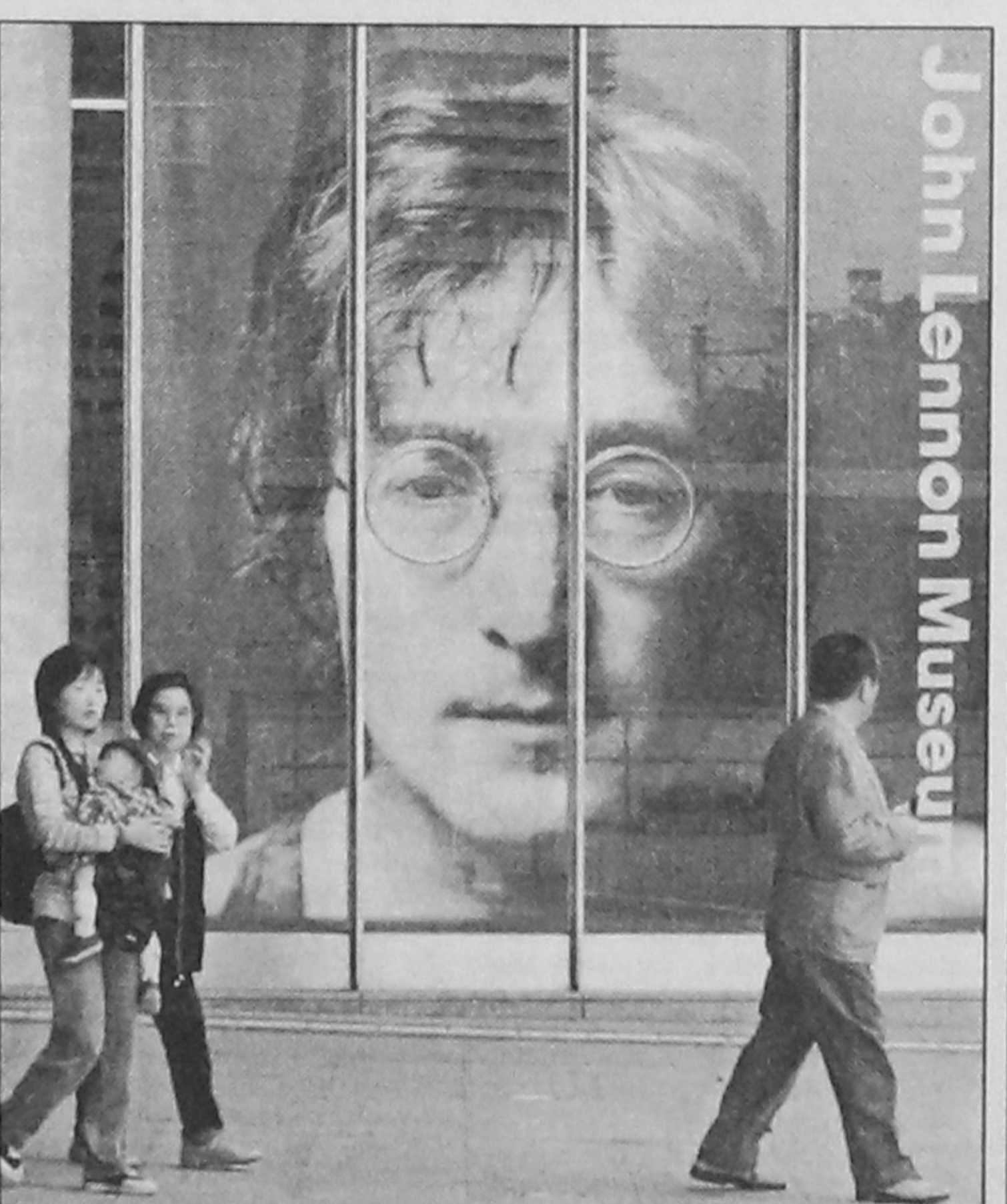
Passers-by walk in front of a huge poster at the world's first John Lennon Museum in Yono, in suburban Tokyo, yesterday. The 3,600-square-metre museum contains about 130 items associated with the life and career of the music legend.