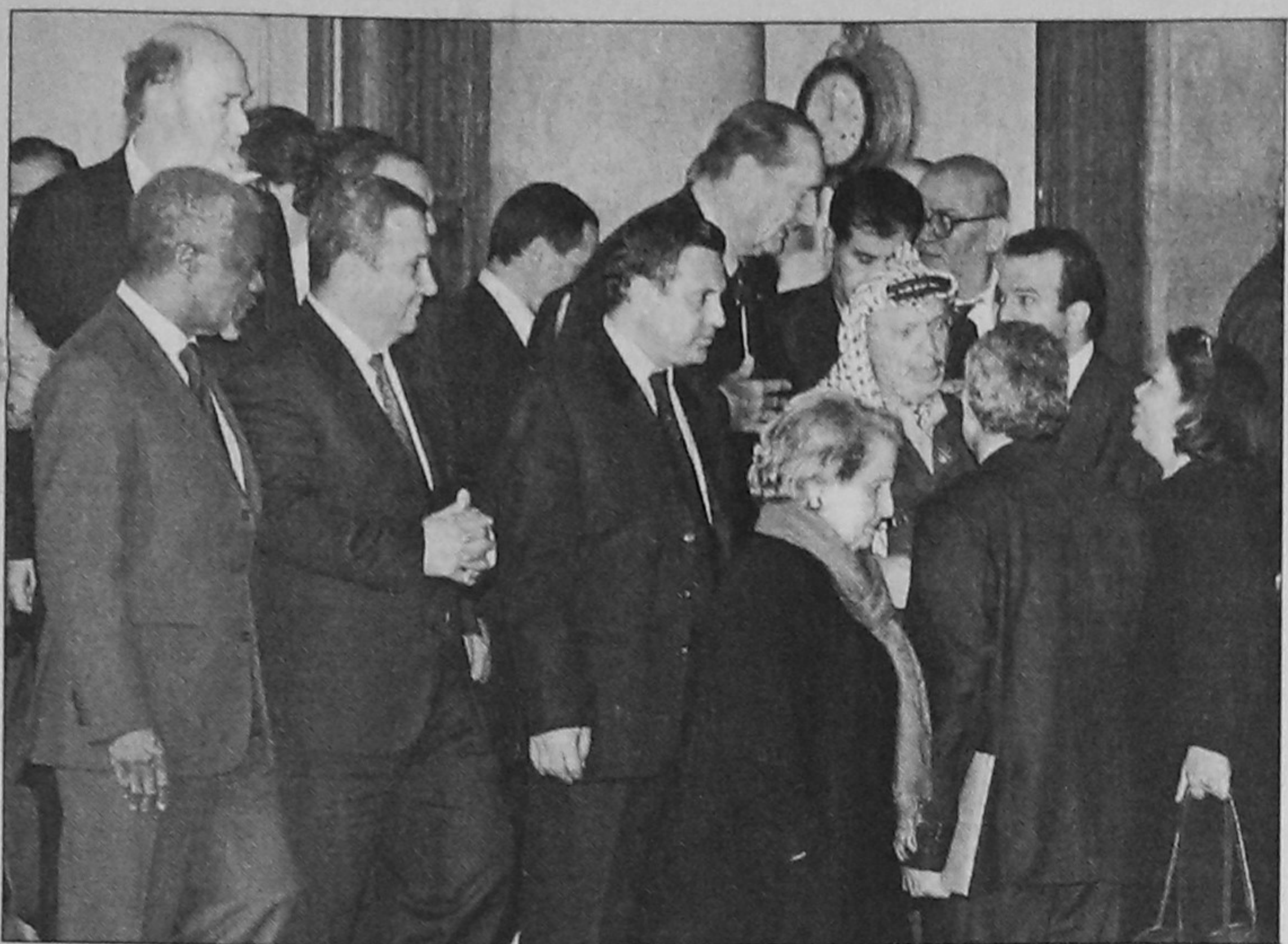
French President Jacques Chirac accompanies Israeli Prime Minister Ehud Barak, Palestinian Authority President Yasser Arafat, US Secretary of State Madeleine Albright, and United Nations Secretary General Kofi Annan at the Elysee Palace on Wednesday after talks on ending the violence in the West Bank and Gaza.