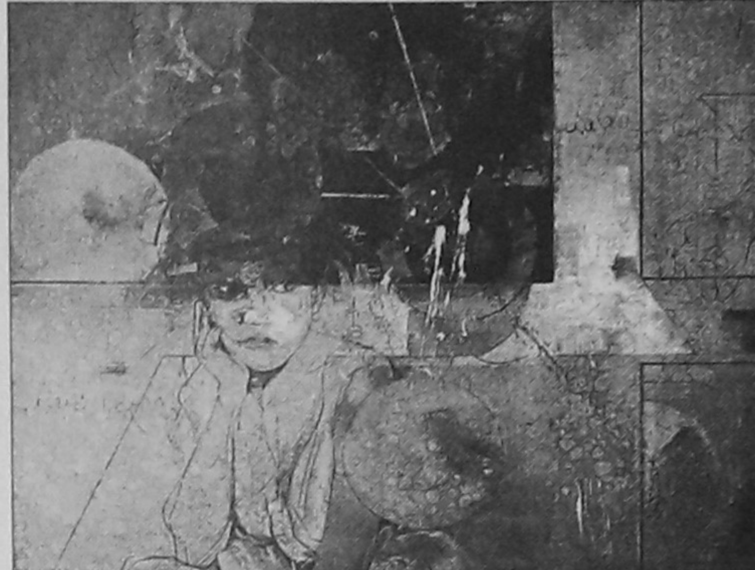
Feeling-1: Oil on canvas

ments, mostly because his images appeared as disturbing through their intense presence. These forms generated a sense of helplessness and pathos in the grim world of daily struggle. But in his present works Ranjit has broadened the scope of his subjects along with its colour configuration but retaining the same rigor of geometrical pattern of squares, rectangles and circles. A calm composure and pathos has replaced the grimness in his early works. The paintings on show capture such tender and lively moments as shyness (Hiding Face in Sari), repose (Combing hair), exuberance (Run), and camaraderie (Boy with goat, Girl with goat, Girl with Flower). The rural landscape as the backdrop with and without figures is a remarkable dimension added to his works. A recurrent motif is the full moon washing the almost invisible landscape in gossamer thin rays that create mistiness and evoke romance. Cleansed of all unsavory aspects by the pristine and all pervading rays of the moon the rural landscape not only looks idyllic it also casts a hypnotic spell. Figures in the paintings are the dominant forms and hold the overall composition