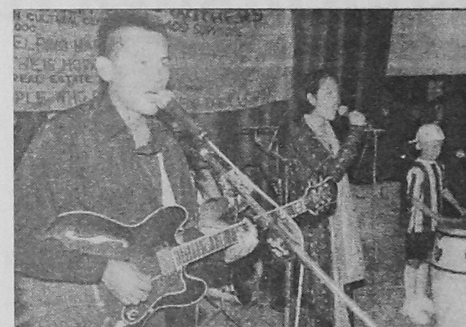
Caring Guys For Bangladesh (CGB) organised a charity concert and film show at the Russian Cultural Centre on Saturday to raise funds for acid survivors

Now so many children are attending the painting class that sometimes it becomes difficult to provide accommodation. The central Kachi-Kanchar Mela, therefore, has taken up a programme for expansion of its building. Recently the Mela sent donation of books and almirahs to its five branches which maintain library for the children. Today the organisation enjoys an enviable position in the country in terms of the positive contribution it made for the enrichment of the mental faculty of the children.