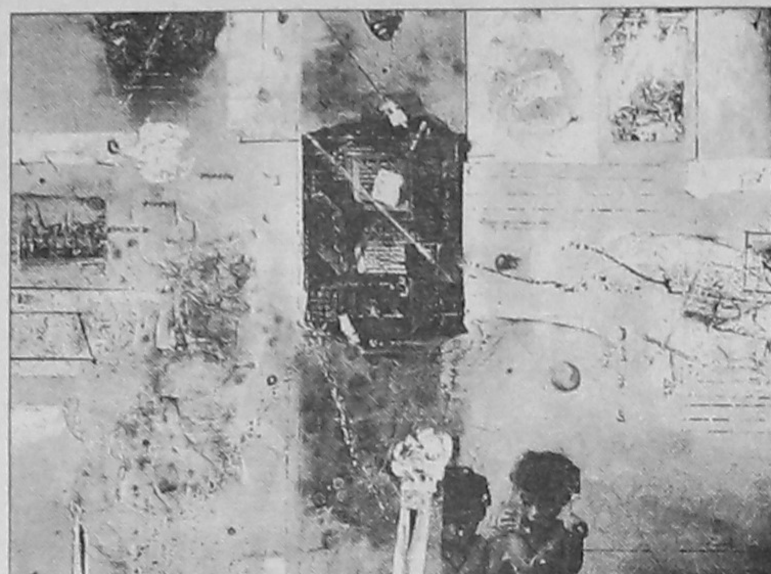
Longing for happiness: Oil on canvas