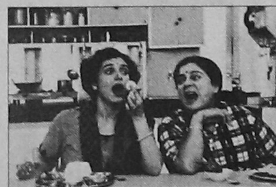
Saans on star plus at 2.30 pm