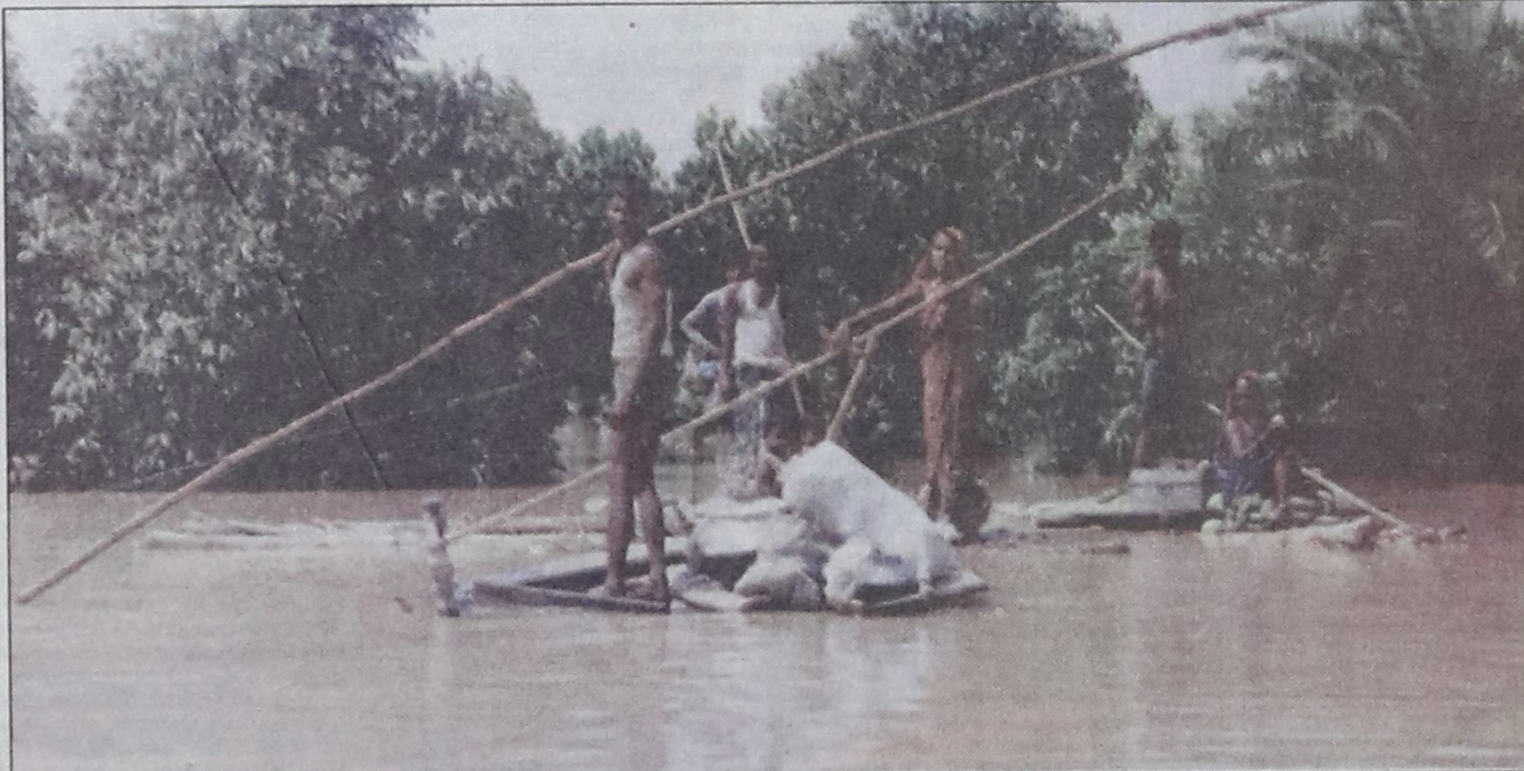
Sheets of water all around. A family on rafts in search of a high land in Moheshpur upazila in Jhenidah district yesterday.