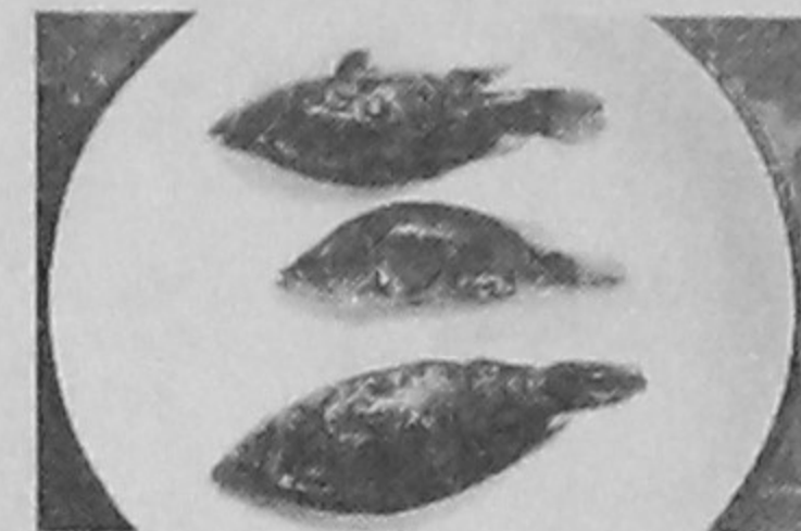
Veda fish produced in the aqua culture ponds of RU Zoology Department.