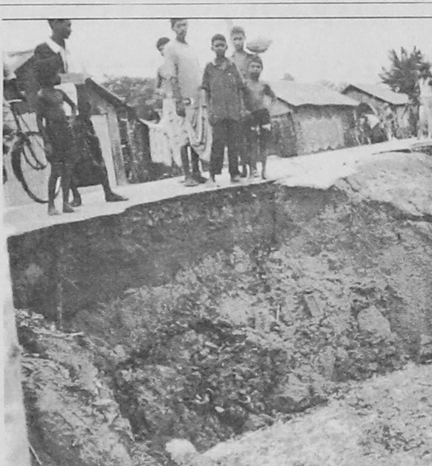
Rain damaged newly constructed busy road of Sirajganj town. Incessant rains for the last few days have been attributed to such condition of the road which runs from the Bazaar Station to the local police station.

18-Town Power Distribution Project PDB, Dhaka. Biddut/Jana-640(4)/2000-2001 GD-920