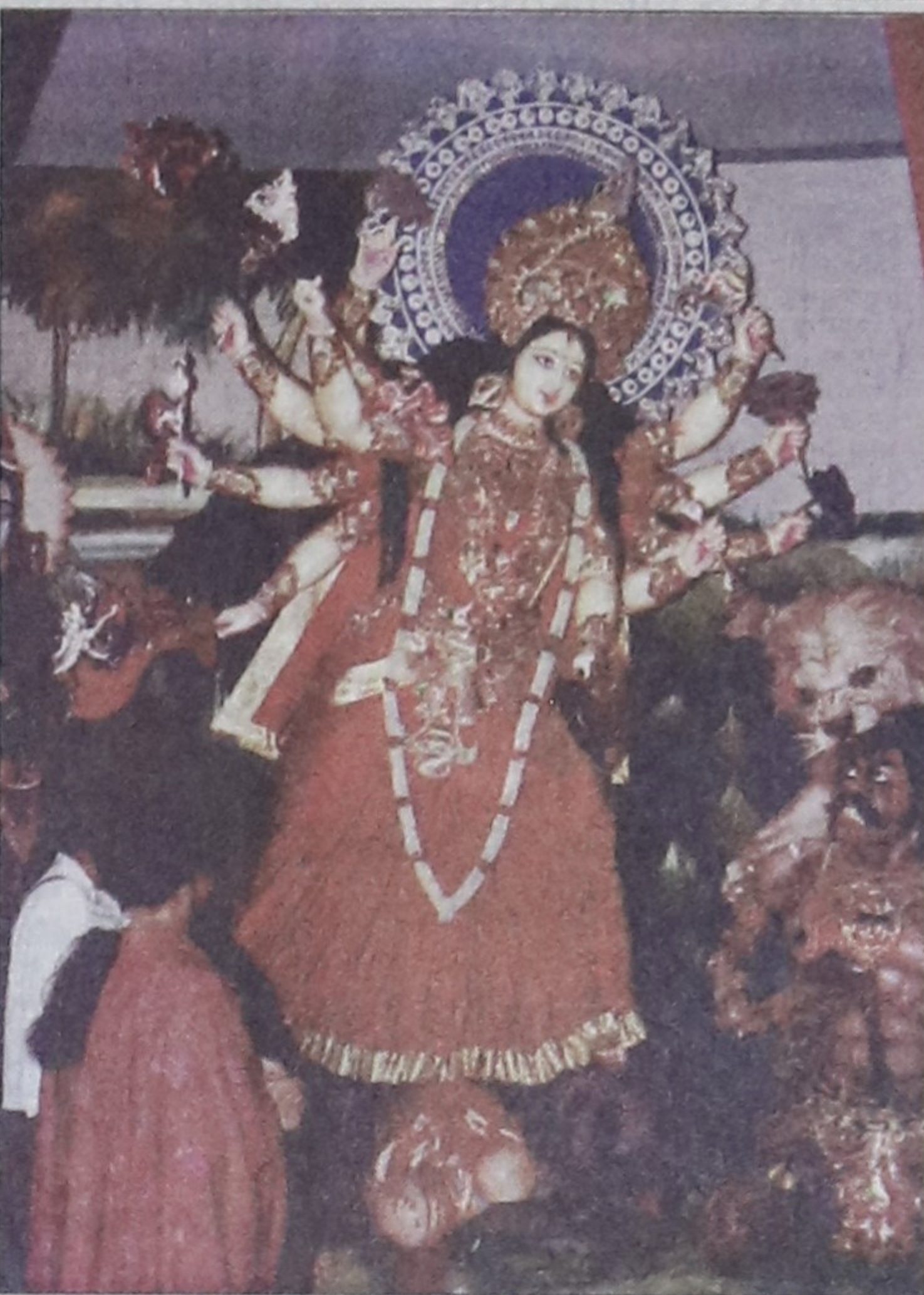
An image of Goddess Durga at Jagannath Hall of Dhaka University. The greatest religious festival of the Hindu community began yesterday.